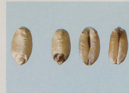
HARD RED SPRING

Kernels severely darkened as a result of excessive moisture during harvest or in storage and suspected of being infected with fungi are considered weather damaged. Loss of grain color and bleaching occur in the early stages when kernels are exposed to adverse weather conditions.