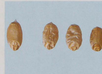
HARD RED SPRING

Premature harvesting or the presence of late-maturing heads results in kernels with a distinctly green color. These have little value and are removed in processing.