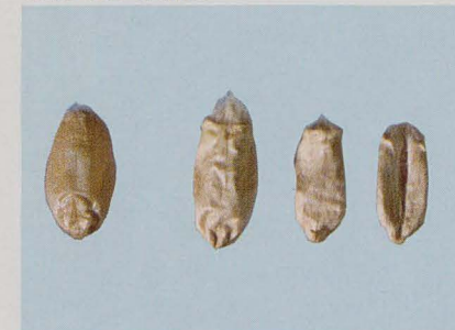
HARD RED SPRING

Wheat classed as ergoty contains more than 0.3 percent ergot. This fungus disease produces black bodies in place of normal kernels.