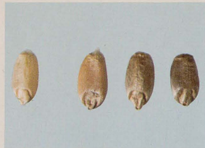
HARD RED SPRING

SOUND HARD RED SPRING AND DURUM WHEAT KERNELS COMPARED WITH VARYING DEGREES OF DAMAGED OR DISEASED KERNELS