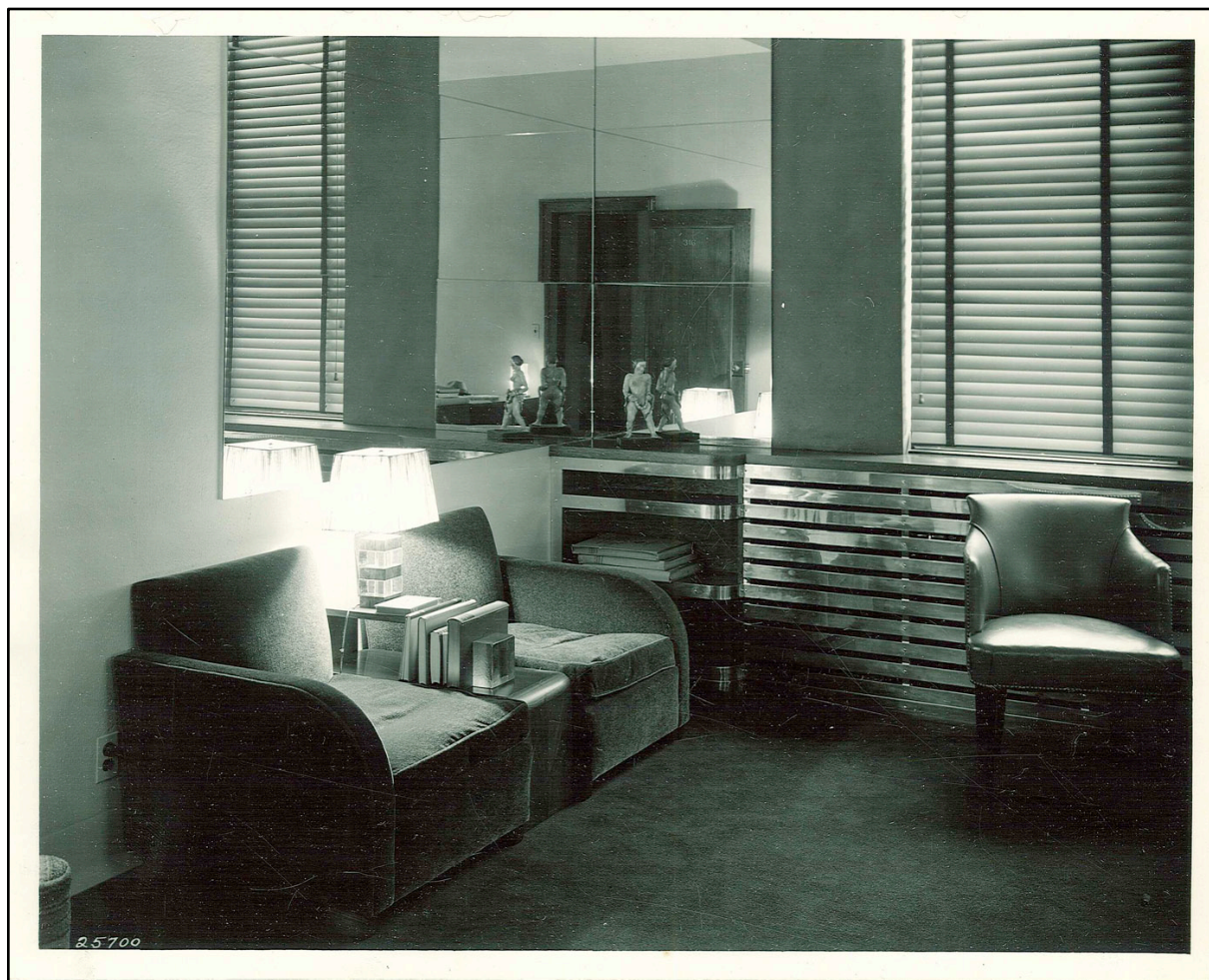
Figure 1. Fine Arts Room furnishings, 1935, photograph. Books from the “School Arts Reference Set” gifted to the University by the Carnegie Corporation are shown amongst the furniture of the Fine Arts Room, which opened in February 1936 adjacent to the University Gallery in Northrop Auditorium.