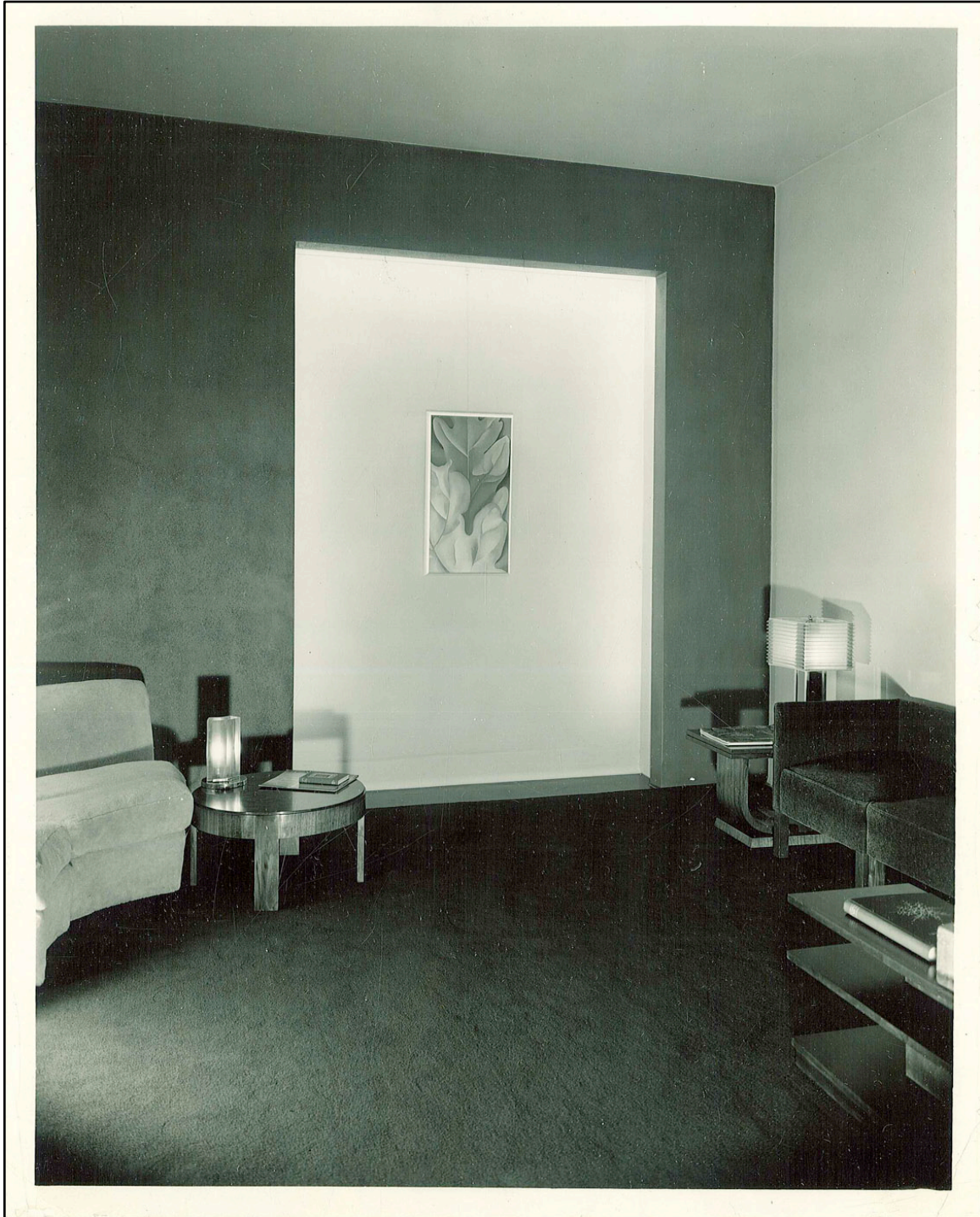
Figure 2. Fine Arts Room featured work , 1935, photograph. Georgia O’Keeffe’s painting, “Oak Leaves, Pink and Gray,” oil on canvas, 1929, is hung in a recessed alcove within the room designed specifically for art appreciation.