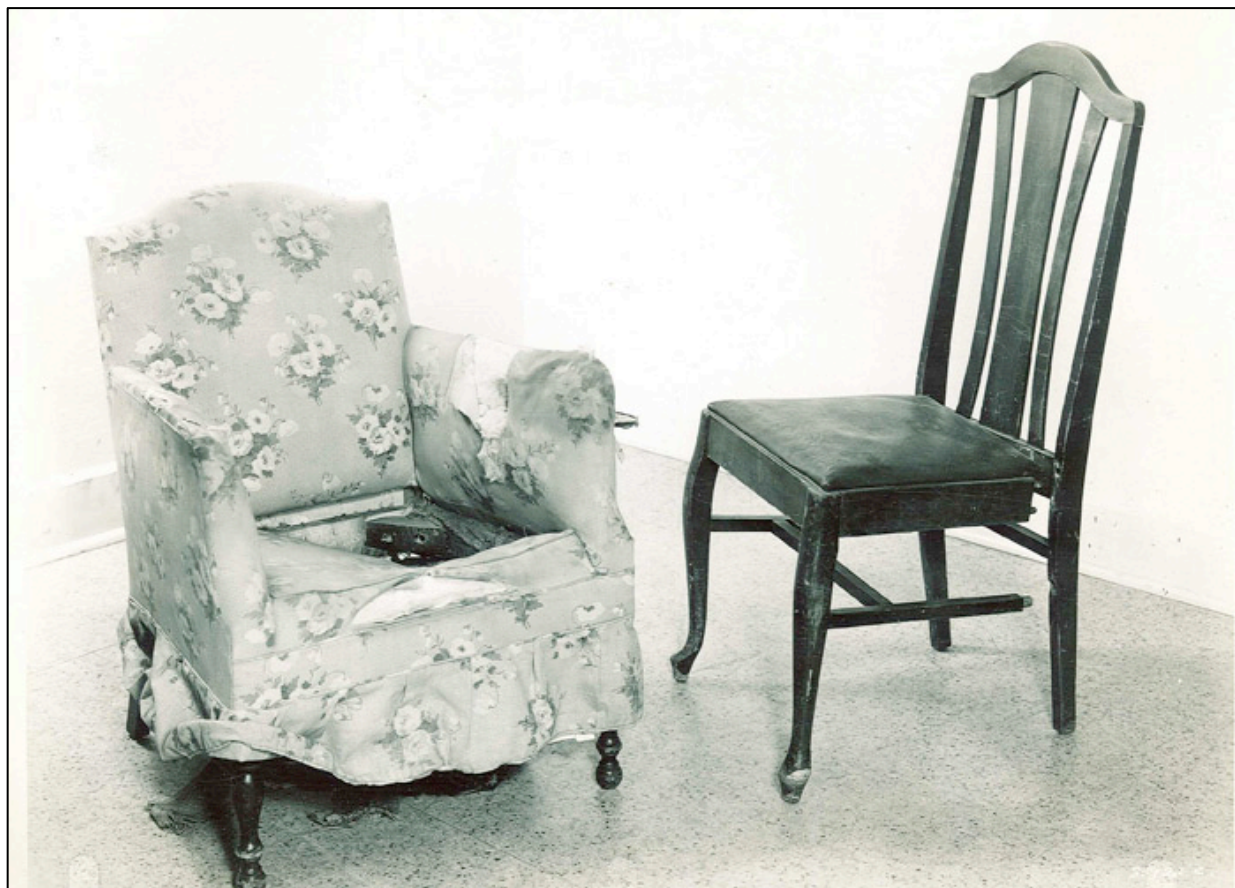
Figure 3. Hints and Ideas for Your Home , 1946, photograph. These chairs were used to demonstrate reupholstering and other basic furniture repairs during the Hints and Ideas for Your Home exhibit.

Demonstrations were given daily by Carl Hawkinson, Gallery Mechanic. Students wishing to try 'to do it' had tools and materials available to them in the arts craft workshop in the student union. 178