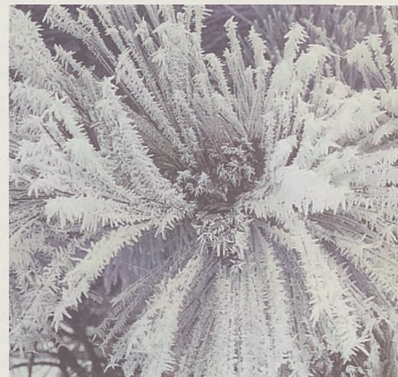
Jack Frost also contributes to the Arboretum magic.