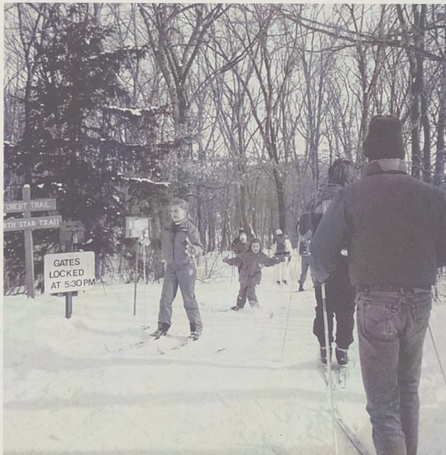
The Arboretum maintains cross-country ski trails throughout the winter.