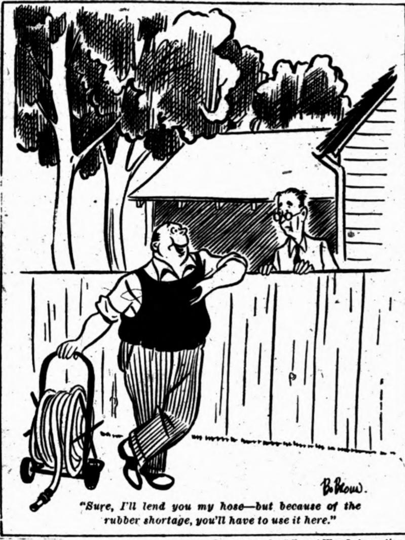
Drawn for the Office of War Information