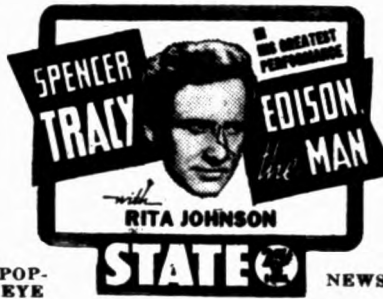
POP-EYE STATE NEWS

The Foreign Policy association of Minneapolis will give a dinner today in honor of Richard G. Casey, Australian minister to the United States. The dinner will be given at the Minneapolis YWCA.