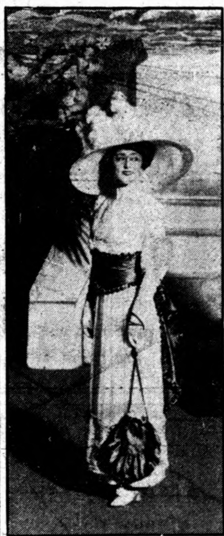
EDNA WALLACE HOPPER, In "Jumping Jupiter."

15c. 2 for 25c. Cluett, Peabody & Co., Makers