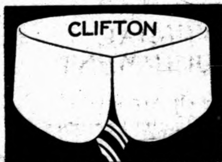
CLIFTON, 2 1/2 in. high BEDFORD, 2 1/2 in. high