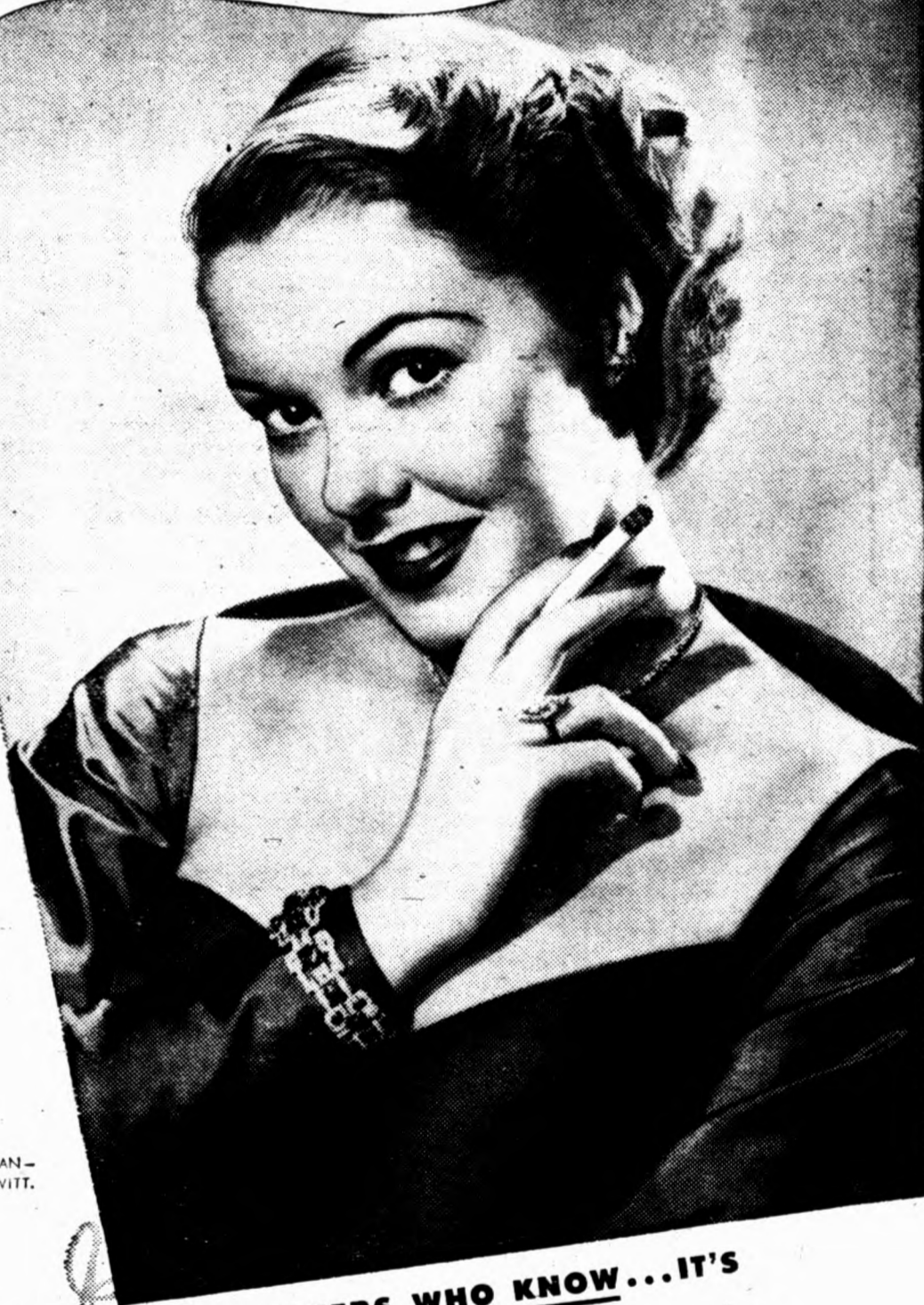
GOWN BY CEIL CHAPMAN—JEWELS BY FIETER DE WITT.