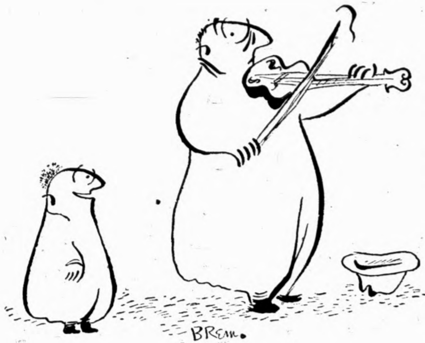
"Let's hear you play some bop."