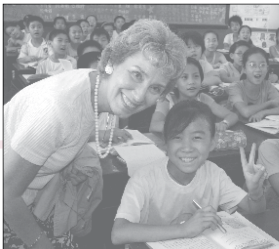
Education Commissioner Alice Seagren visits a school during her trip to China in June.

The China Center, with support from the Chinese Language Council International (Han Ban) under the Ministry of Education in Beijing, organized a group of Minnesota superintendents, principals, and teachers to travel to China in June. The delegation was led by Education Commissioner Alice Seagren and funded by Han Ban. The purpose of the visit was to give Minnesota educators a first-hand understanding of China, its educational system, and the resources available to start a Chinese-language program in their schools or districts. Delegates learned strategies to bring Chinese language and culture into their classrooms and were able to explore potential relationships for their schools. The delegation visited primary, middle, and high schools in Beijing and Xi'an (capital of Minnesota's sister-state, Shaanxi Province). Commissioner Seagren addressed more than 400 U.S. and Chinese educators at an international conference on the Chinese language at the Great Hall of the People. The trip was a great success, and many of the delegates have already begun to implement or plan Chinese language and cultural courses at their schools.