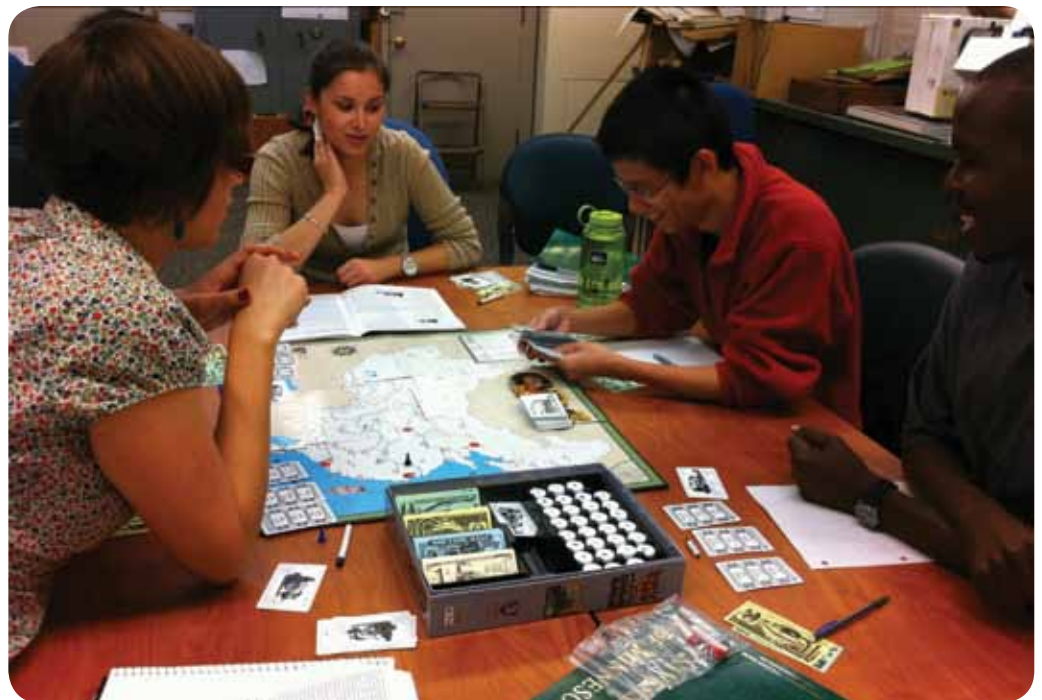
Board games are a useful tool for teaching planning concepts to engineering students.