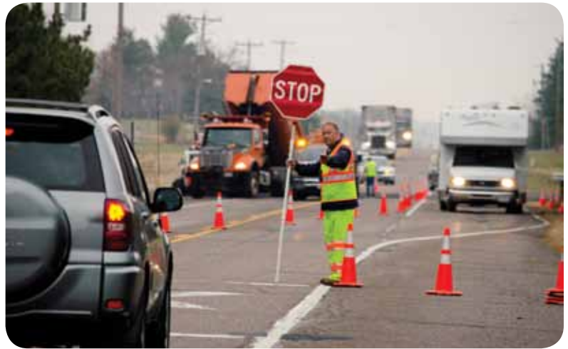
The technology gives drivers advance warning of upcoming work zones.

To accomplish this goal, researchers developed and successfully field-tested a hybrid traffic information system that allows the traffic data being transmitted by vehicles with DSRC (about travel time, starting location of congestion, and the location of snowplows) to be received seamlessly and securely by portable changeable message signs placed along the roadside. The research was sponsored by the Intelligent Transportation Systems Institute, a part of CTS.