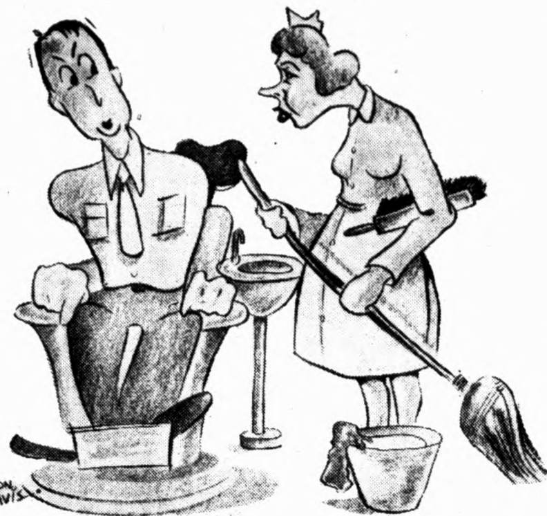
"Doc says I'm s'posed to clean your teeth."

That did it. The aroused membership mumbled a unanimous vote that the Bitter club's request be sent back with no regrets.