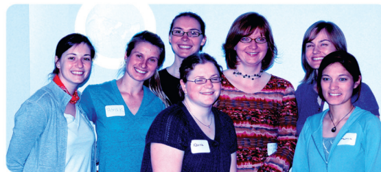
A group of our graduate students at the 2010 Grad Student Recognition Day & Hodson Alumni Award Lecture

Visit our giving page at http://www.entomology.umn.edu/Giving/index.htm for more information.