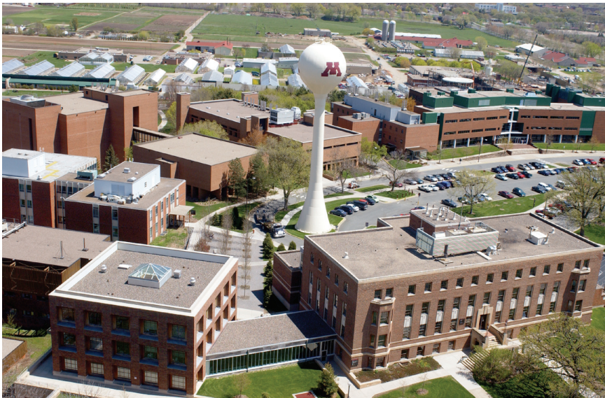
Aerial shot of St. Paul Campus showing Hodson Hall in the upper left.

Web page: http://www.entomology.umn.edu/