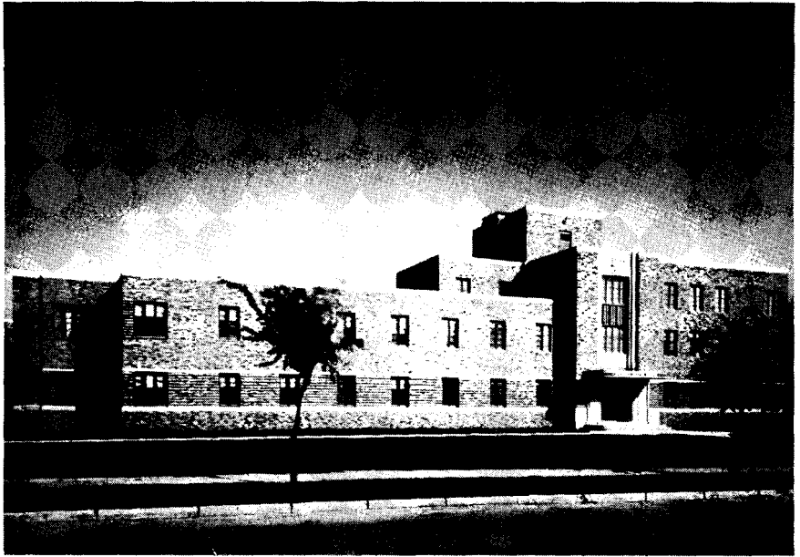
Students' Health Service