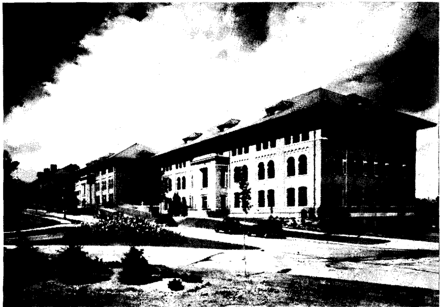
Left to right—Coffey Hall, Agricultural Engineering, Haecker Hall