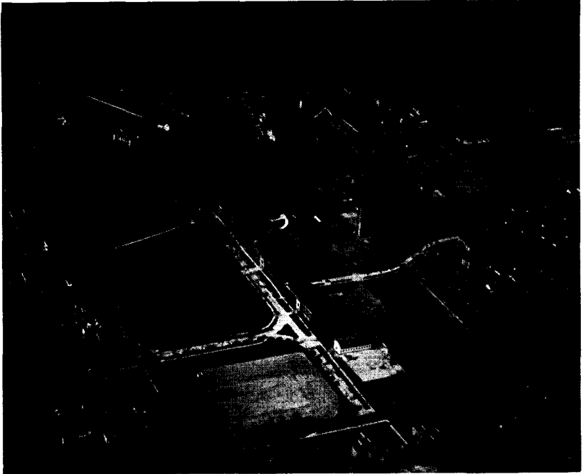
Air View of St. Paul Campus