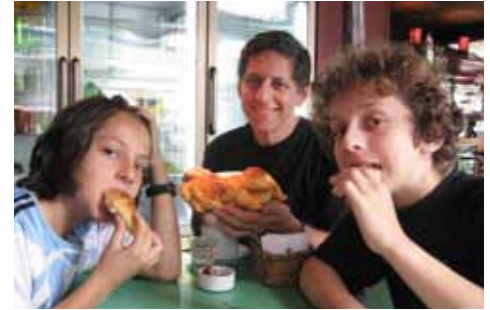
Enjoying media lunas.

My job now, both professionally and personally, is to continuously refocus through an ever-changing lens as I observe, react, and respond in this global society.