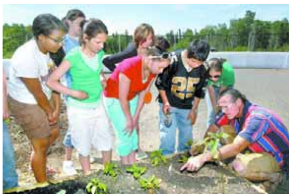
Pictured: Ninth- and tenth-grade students participating in CAIMH's Journey Garden Program.

"KSTP TV News" featured Smiley's Clinic in an April 3, 2009 story about the new sales tax for smoking cessation.