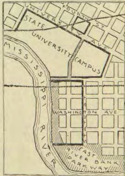
MAP SHOWING PROPOSED ADDITION TO UNIVERSITY CAMPUS.