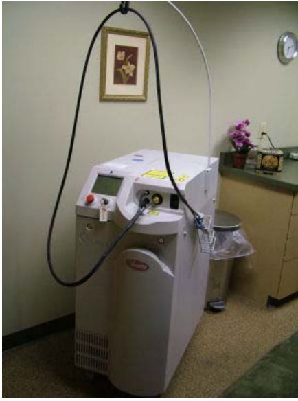
A pulsed-dye laser in an exam room

There are many different ways to treat a wart, but not all ways work for every person – there is no "magic" treatment. Conventional treatment involves freezing the wart with liquid nitrogen (cryotherapy) or injecting cantharidin, a chemical which makes the wart blister then fall off. These work in about 70% of patients. Another, newer method uses a "pulsed-dye laser" capable of targeting the wart's blood supply. A recent study showed that this treatment was equally effective, much more expensive, but somewhat less painful than standard methods.