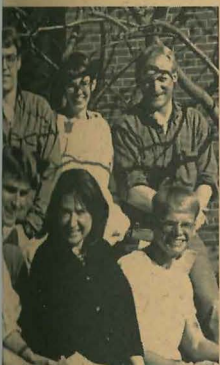
ts take a break.