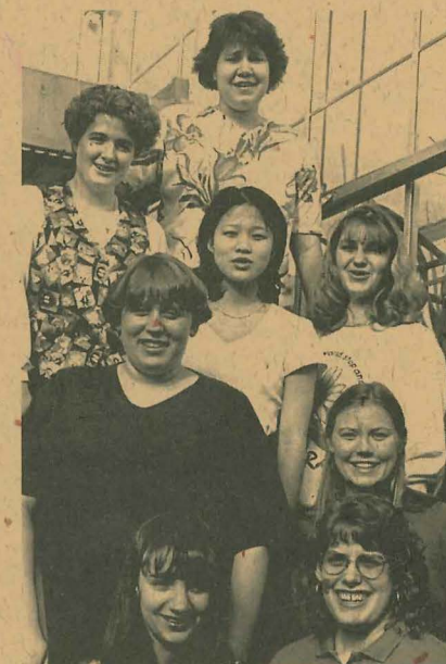
Women in Science