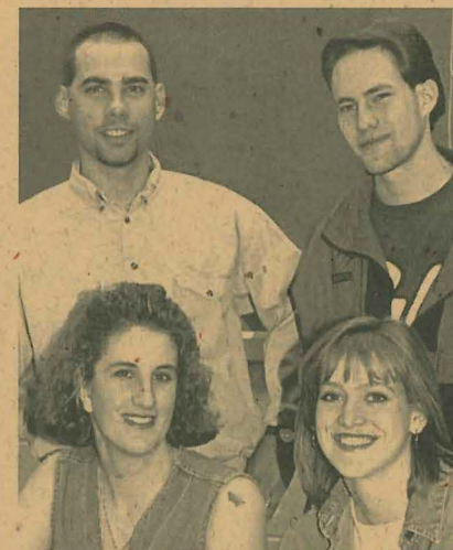
Students in the UMD Pre-Med Club

Women in Science and Engineering (WES) is a club for all women in science, math or engineering fields at UMD. The club's main objective is to encourage women to enter and stay in technical fields. There are three main committees: outreach, fund-raising, and social events. The Outreach Committee, concerned with community involvement, each year puts together a panel to visit high schools in the area. This year the fundraisers sold Candy-grams. The Social Committee organized several pizza parties and a trip to the Lake Superior Zoo and will sponsor a barbecue later this spring. WES will be joining the Biology Club and the Pre-Med Club in presenting a professional panel this spring, giving students the opportunity to meet professionals and to network for jobs and internships.