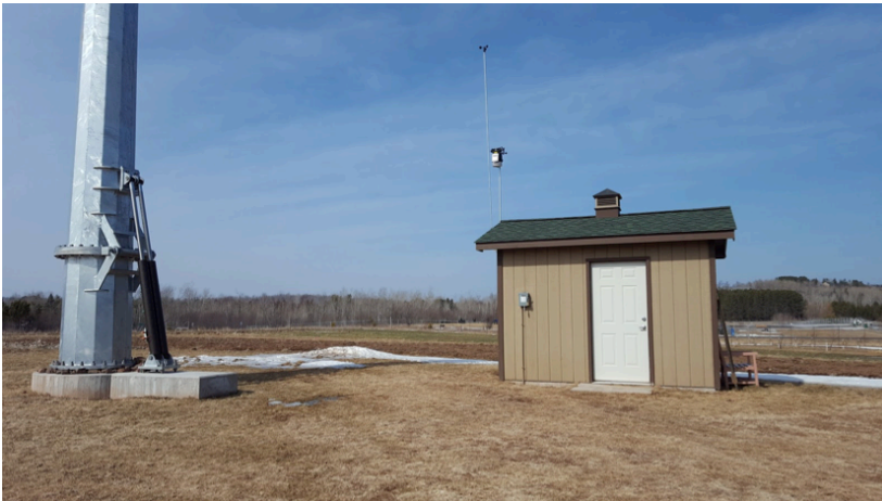
New Weather Station at the Land Lab