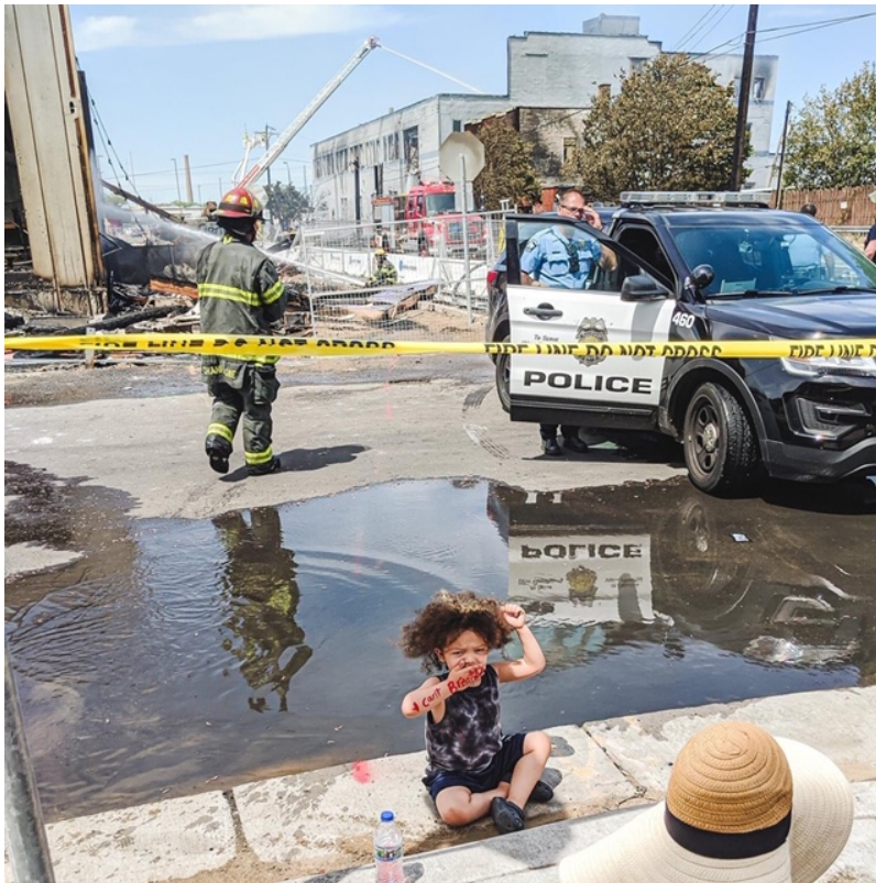
Photo taken by U of MN Crookston alumnus Ian Timberlake near his home on May 29, 2020

We are humbly reminded of the work yet to be done to prevent violence and create a just and equitable society.