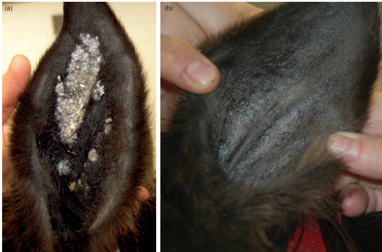
Figure 1. (a) Coalescing plaques covered with a whitish keratinous crust occupying most of the concave aspect of the horse's pinna; (b) complete resolution of plaques after treatment with imiquimod 5% cream.

As a result of the severe inflammatory reaction induced by imiquimod, the administration of the cream was not an easy task and most horses required sedation before each