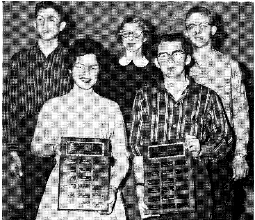
Pictured above are students at the Northwest School of Agriculture who won championship or reserve championship awards for their 1957 home project work. These awards were made at an awards assembly held on January 14. There were 290 students enrolled for summer home project work in 1957.