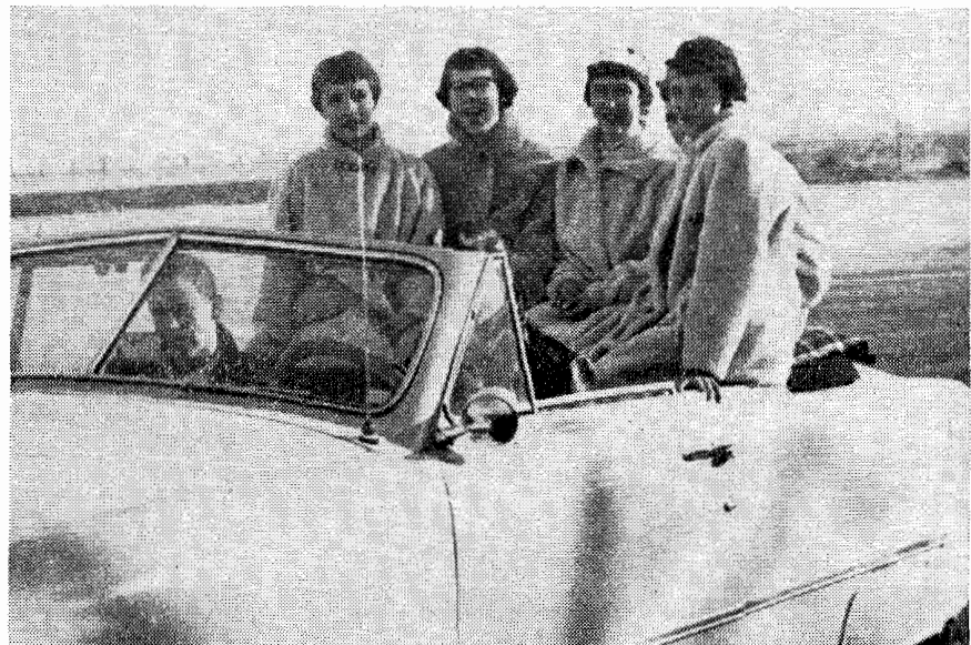
1955 HOMECOMING QUEEN AND HER ATTENDANTS