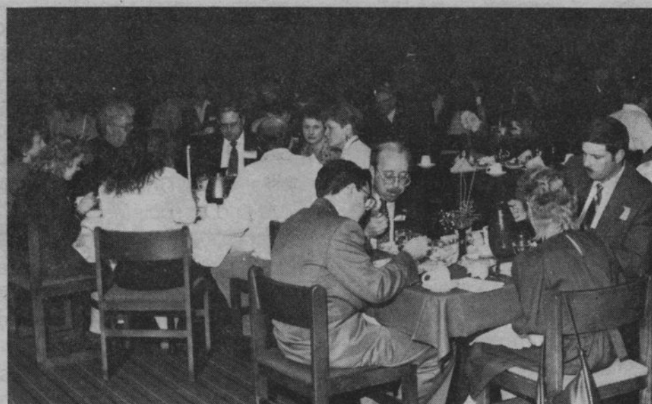
Scholarship recipients and donors met for the recognition dinner and program.