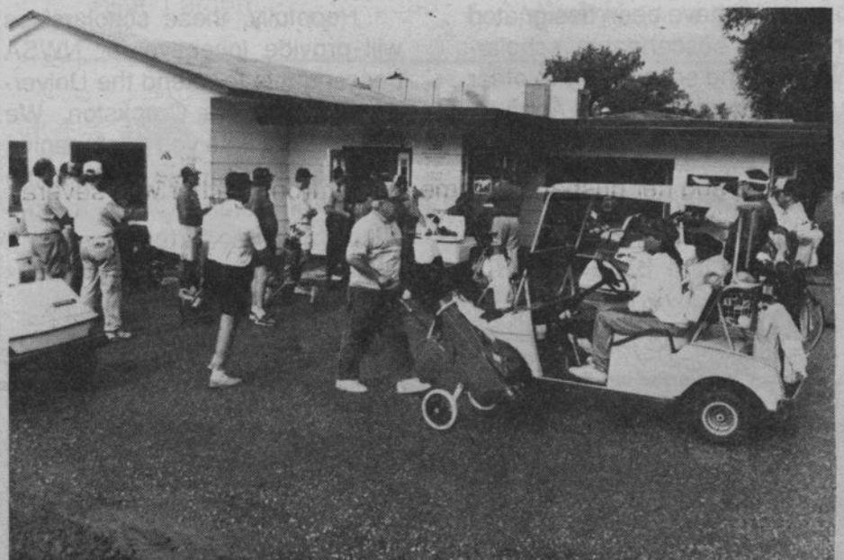
Are you walking or riding? Golfers gathered for the first tee-off.