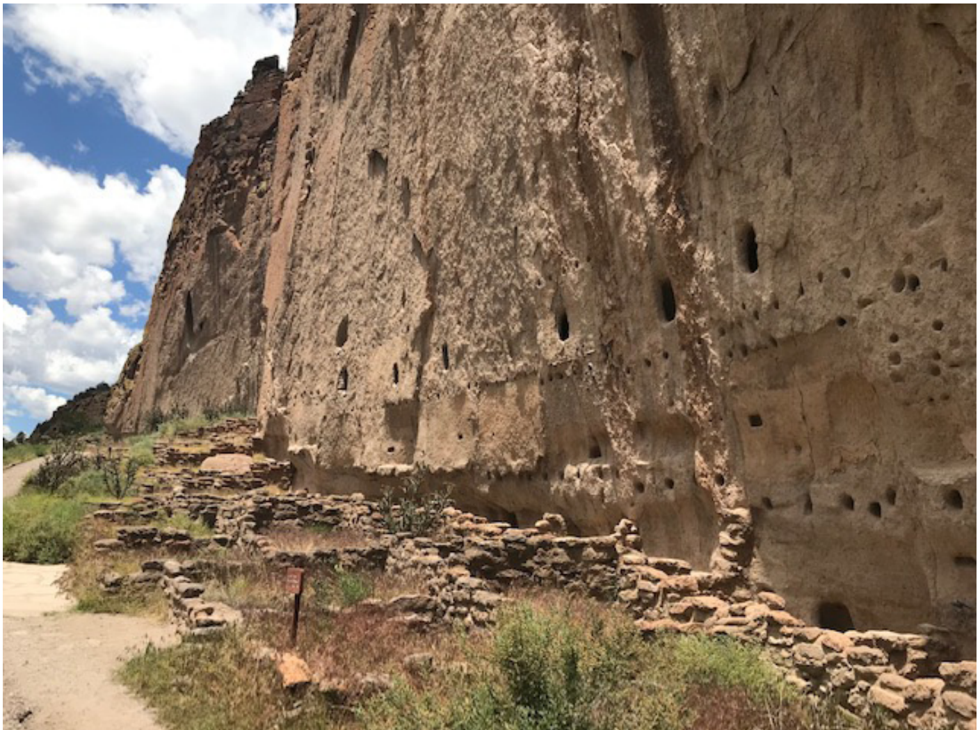
Constructions and chambers excavated within the compacted ash at Bandelier National Monument.