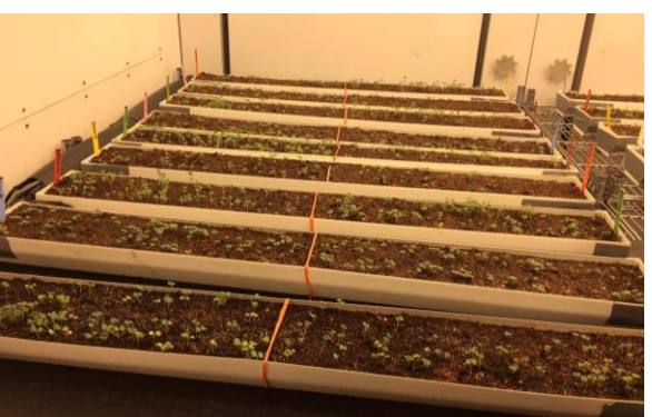
Figure 2. Freshly germinated greens inside growth chamber

An experiment was setup in a growth chamber, an enclosed chamber that allows the microclimate to be programmed for experimental plant growth. For this experiment, the chamber was programed to 45-75 °F, 60% RH, and 10.5 hr days. Six cultivars typically grown in the Diminishment season—Mizuna, Mizspoona, Arugula, Esmee, Ovation Mix, and Carlton-- were grown ½ with a germination mat and ½ without a mat, and replicated three times.