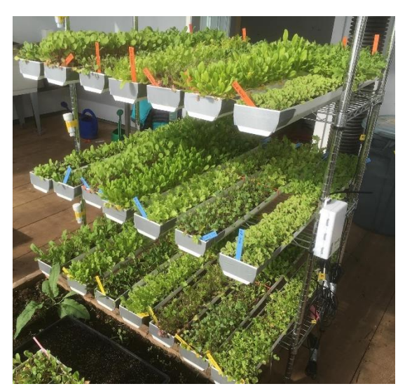
Figure 2. Experimental setup for cultivar & substrate trials

During the winters of 2018-2019, salad green cultivars were evaluated to identify those best suitable for use in Deep Winter Greenhouses (DWG) in Minnesota. Cultivars were selected based on grower preferences, previous research in DWG, and seed company descriptors of traits such as "germination at low temperatures", "slow to bolt", and/or "early maturing" that would be beneficial in the unique DWG growing system (Table 3). Following grower practices, greens were grown in standard gutters (4.5" x 40") filled with a custom grower media mix (Table 2). Greens were seeded at recommended rates, mostly 144 seeds/ft<sup>2</sup>, and harvested at maturity (~4-5") up to three times in a given sub-season.