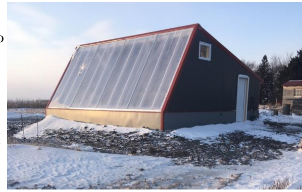
Figure 1. Deep Winter Greenhouse in Madelia, MN.

For more information please visit: https://extension.umn.edu/growing-systems/deep-wintergreenhouses