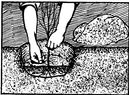
Plant trees to proper depth, spread roots well, and tamp soil as it is filled in.