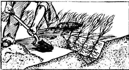
"Heel in" trees on arrival if planting cannot be done within a few days.

Trees properly heeled in should stay in good condition for a week or ten days. When you are ready to plant, large numbers of small trees can be carried at one time by placing them in a bucket half full of water. For larger trees wrap the roots in wet sacks or cover roots with wet moss, carry to planting area, and plant immediately. Do not under any circumstances allow the roots to dry out. Dry roots mean dead trees.