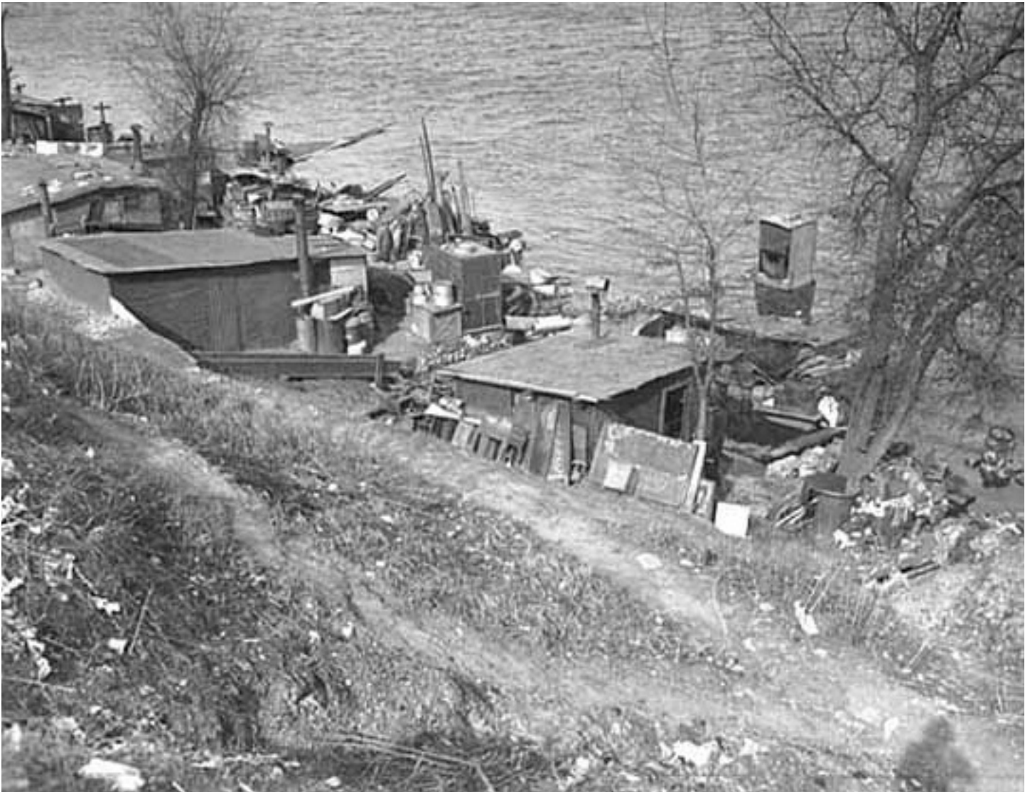
“Squatters ousted from their housing on banks of river at Camden Park, Minneapolis.”