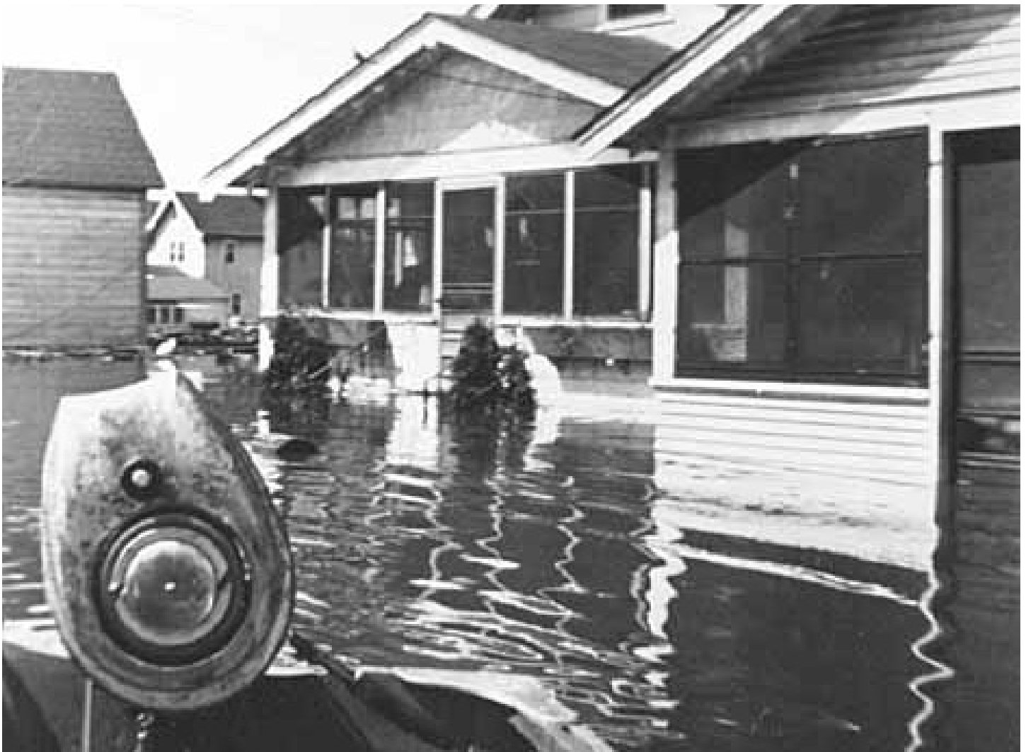
“Flooded upper levee area of St. Paul.” taken in 1952.

These floods occur due to the unique position of the Twin Cities: the Mississippi River Gorge. The gorge was created by the retreat of the St. Anthony Falls; as the river eroded the soft St. Peter Sandstone, it caused the top layers of limestone and shale to break off, moving the waterfall from St. Paul to its current location. This process left behind the gorge's steep bluffs and a limited floodplain, the river flats. When snow and ice melt upstream during the spring, or when the Mississippi River Basin receives large amounts of