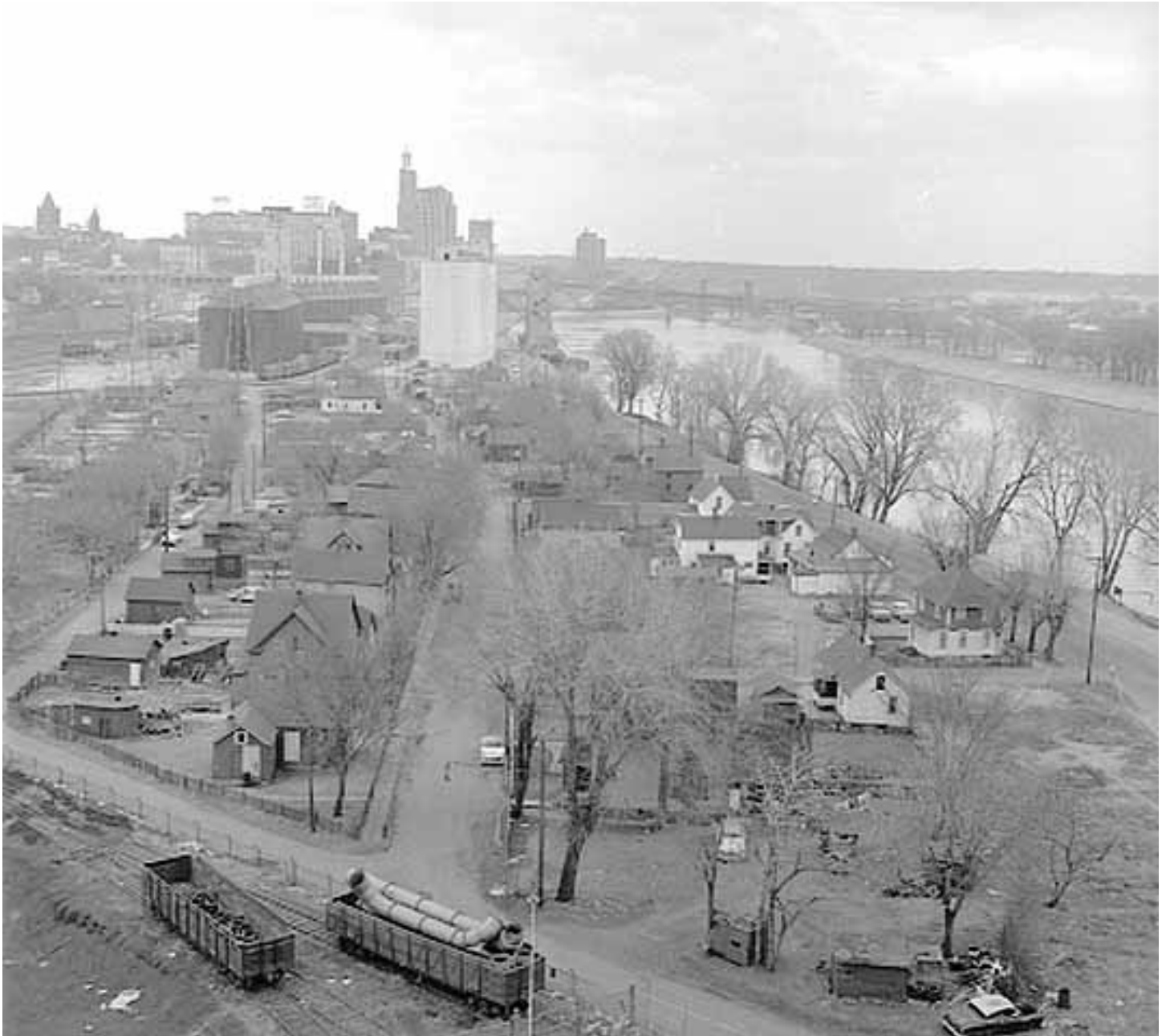
“Shepard Road and the Upper Levee, St. Paul”, Taken between 1950-1959.