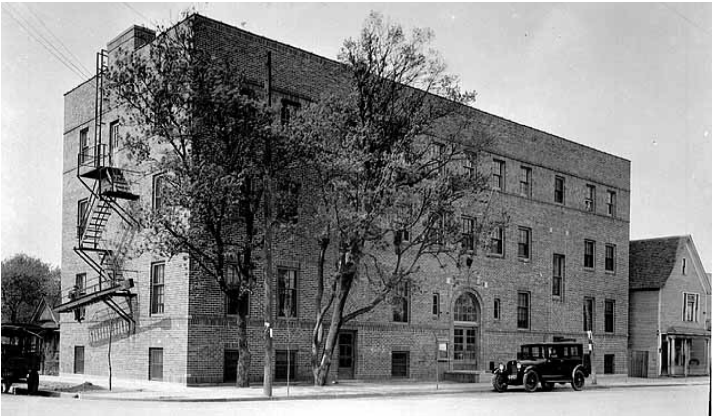
“Neighborhood house, Indiana Avenue and Robertson Street, St. Paul.”