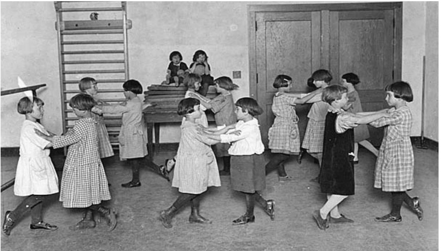
“Dancing class, Neighborhood House, St. Paul.” Taken by Carl R. Ermisch in approximately 1920. Courtesy of the Minnesota Historical Society.

As rumors of an industrial park at the West Side Flats began to circulate, the Neighborhood House created the “Old West Side Improvement Association” to protect the