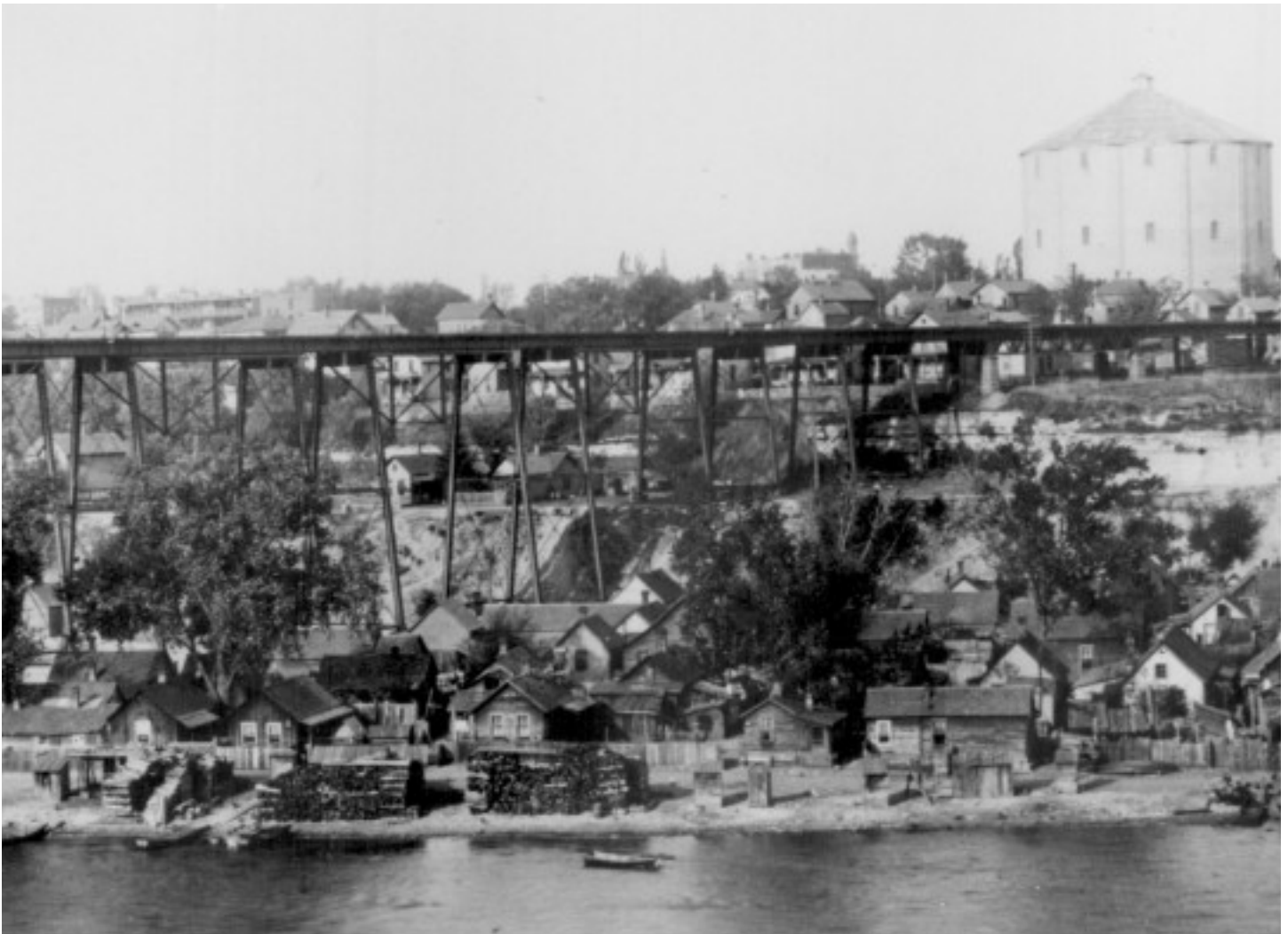
“View of Bohemian Flats from Across the River.”

There was also a notion that the flats community was distant from the city and the residents free from the influence of Americanization; in actuality, there were a number of reasons to venture off the flats. Aside from a grocery store and a Lutheran church, most services were only available in the surrounding city. The residents of the