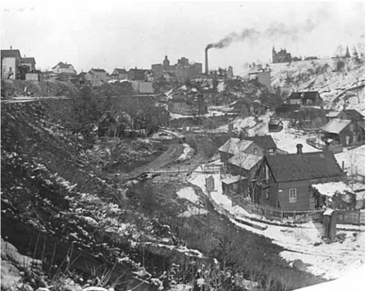
“Swede Hollow, St. Paul.”

Connemara Patch. Minneapolis was home to three settlements of its own as well. Two of these were known as the East Side Flats; one at the site of the East River Flats Park below the University of Minnesota campus and the other beneath the 35-W and 10th Ave Bridges. The other was the Bohemian Flats, located just across the river underneath the Washington Avenue Bridge.