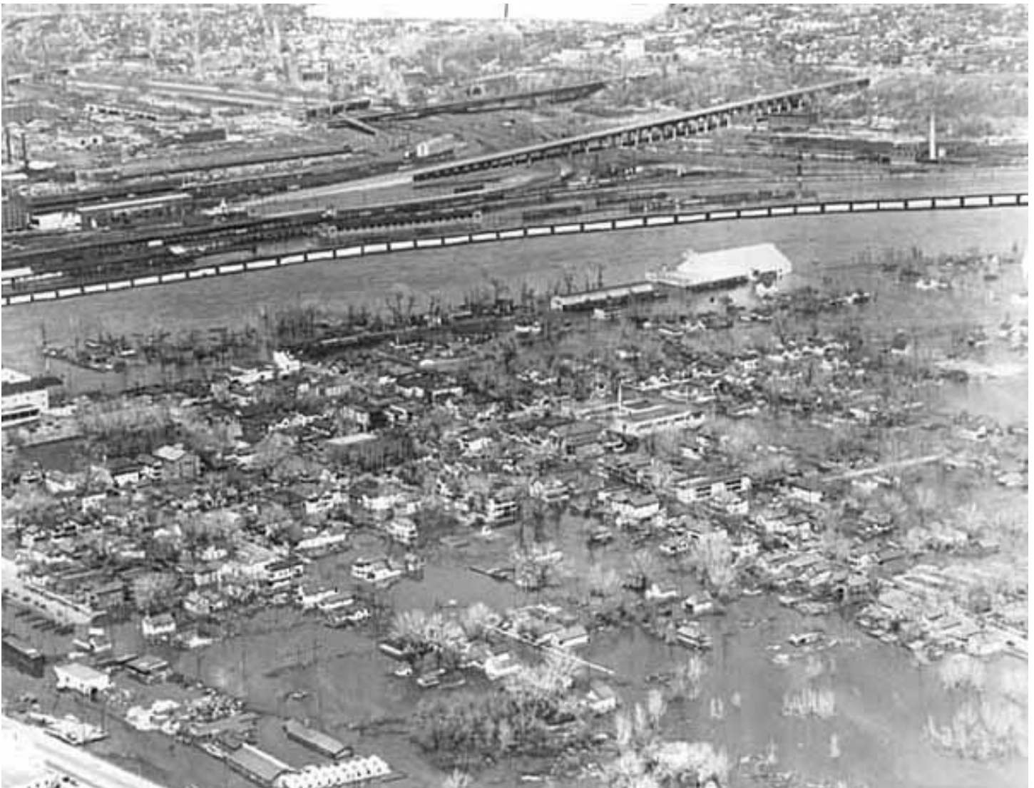
“West Side of St. Paul during flood.”

their rights. Though assured by these representatives that urban renewal was in the best interest of the city, the West Side community resisted the change. Even former West Side residents joined the group, often still bound to the community by religious institutions or workplaces.[viii] When the remaining homes were demolished in 1962, the Neighborhood House followed members of the community onto the Upper West Side, where it continues to serve the needs of St. Paul's newest residents.