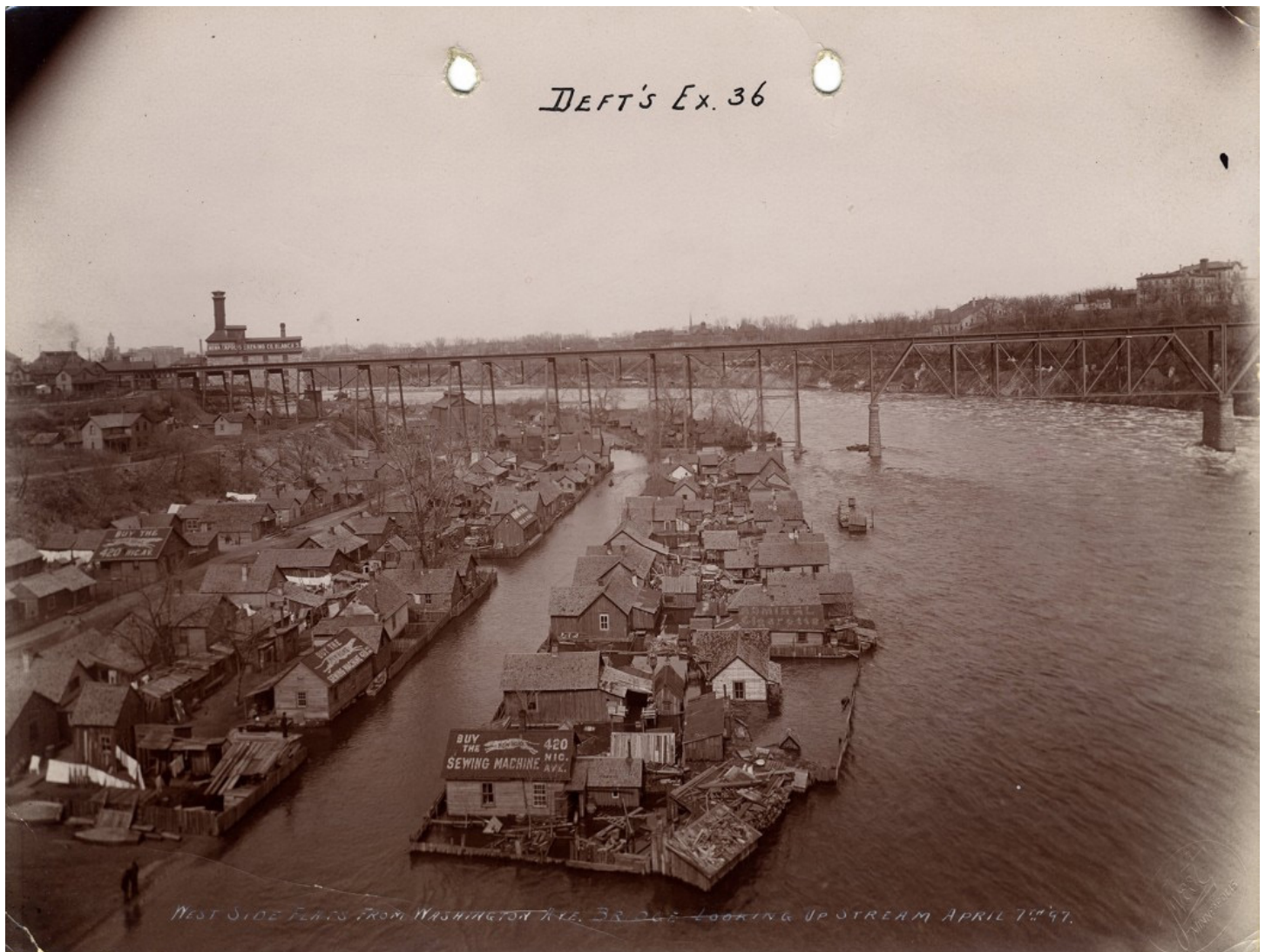
Spring Flooding at the Bohemian Flats in 1897.

as their own separate settlements, distant from the city located above. The residents of these areas bore a number of labels, ranging from penniless criminals to hard-working new Americans. Today, the communities are often remembered as cultural havens, places where recent immigrant families could practice their traditional customs and beliefs, separated from the city both physically and culturally.