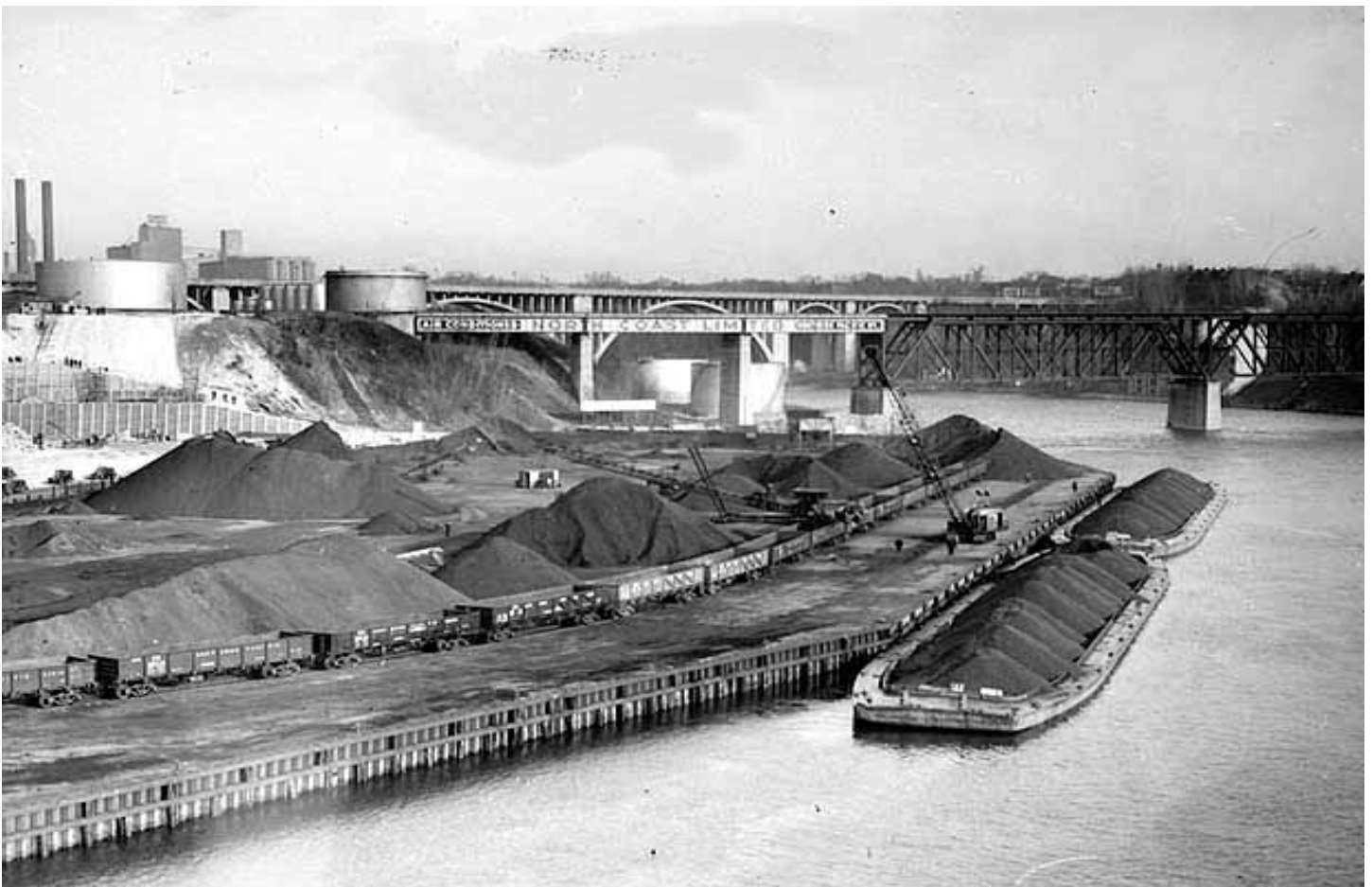
“View of Mississippi River showing coal barges at Municipal River Terminal, Minneapolis.” taken in approximately 1940.

however, the industry at the riverfront has shrunk; the Upper Levee is home to the “Riverview at Upper Landing” apartment complex, while plans to give the West Side Flats a residential facelift are underway. When the residents of the West Side Flats were removed in 1962 by the St. Paul Port Authority and the Housing and Relocation Authority, the community, informed that they would have public housing options, assumed the public housing would be built on the flats, allowing the settlement to remain intact. To their dismay, public housing was never constructed on the Lower West Side, though there was plenty of room to do so.[ii]