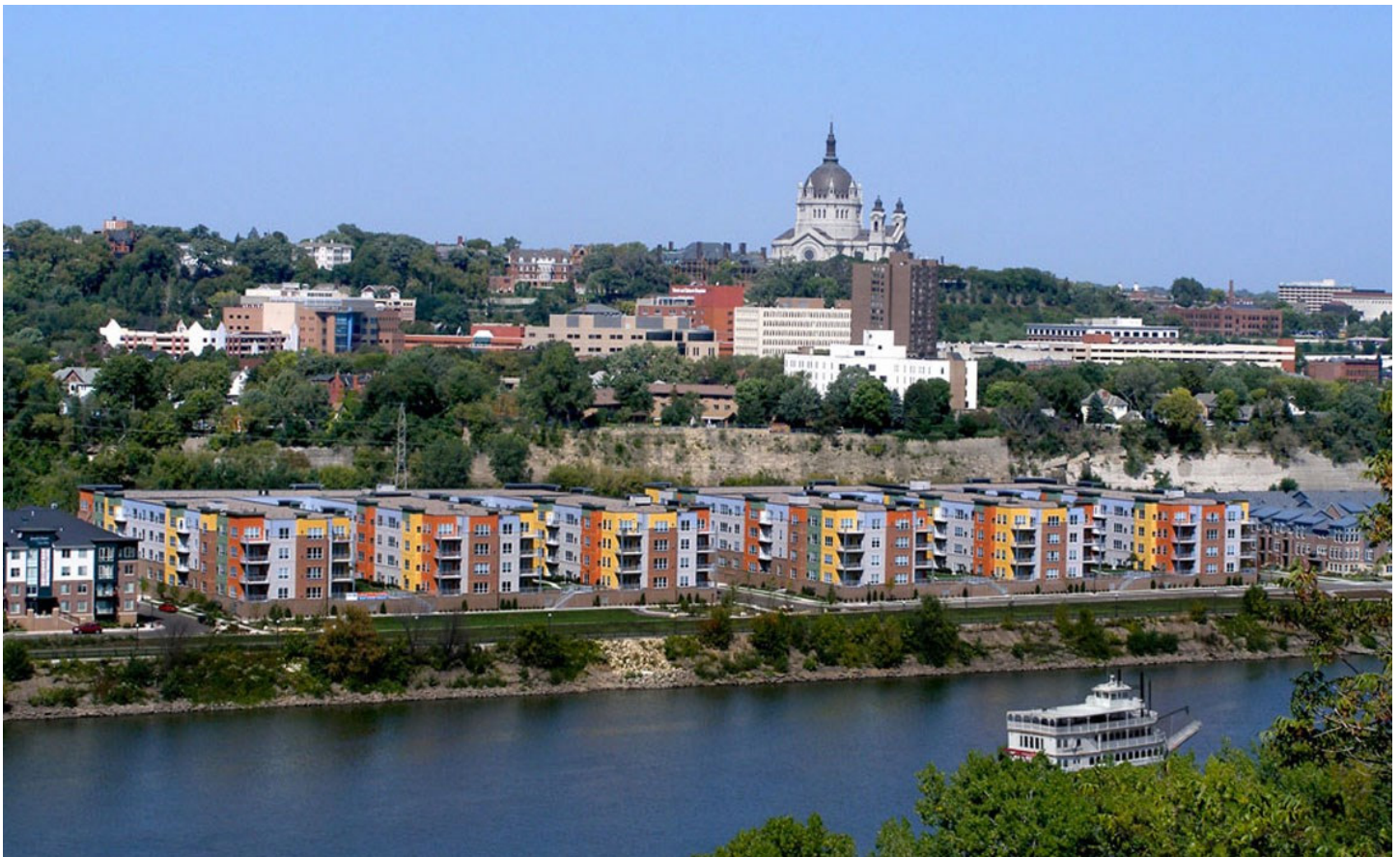
Riverview at Upper Landing Apartments.

maintained that it was wrong to charge rent for land on a river flat because it was claimed by the rising water each year.[iii] They were evicted to make room for a Municipal Barge Terminal which would allow for river trade routes. How long will the apartment complexes at the Upper Levee and the West Side Flats remain in place before another use takes precedence?