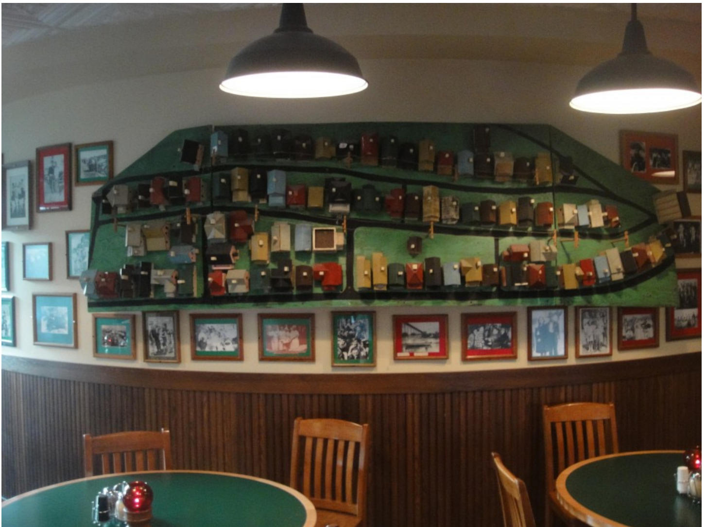
Model of the Upper Levee in Cossetta's Restaurant in St. Paul.

recently arrived single men, and was constantly featured in the newspapers for the drunken fights and altercations between residents.[ii] As these men made enough money for their families to join them, they moved up to the West 7th Area, vacating the flats for the Italian community. By 1910, the community's population was three-quarters Italian, and would remain so until the residents were evicted in 1959.[iii]