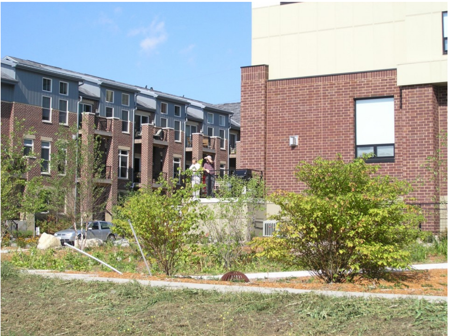
Upper Landing and Residents

Simply put, we are in danger of privatizing our riverfronts to the point where the descendants of former residents won't be able, or feel comfortable, walking where their grandfathers and grandmothers once lived. On St. Paul's Upper Landing this has already happened; the narrow strip of public land and pathway outside residents' front balconies