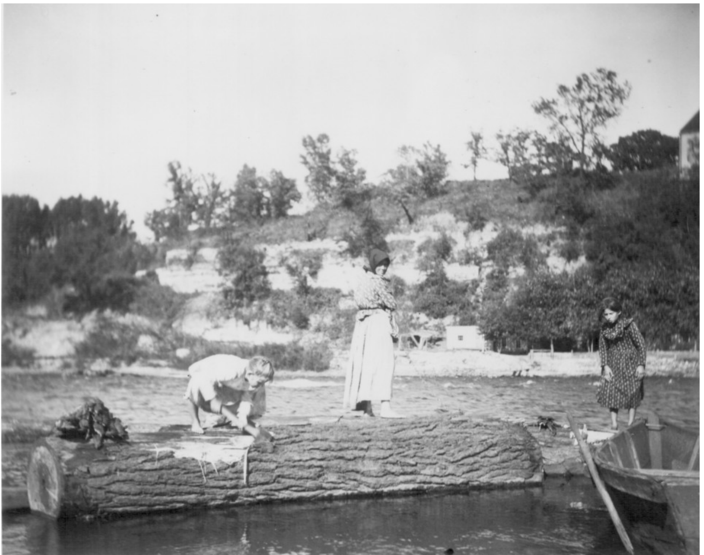
“Women Gathering Driftwood from the River on the Bohemian Flats.”

The WPA guide also notes that wood wasn’t the only thing the residents of the Bohemian Flats rescued from the Mississippi: “Oranges and bananas, dumped into the river by wholesale fruit houses, sometimes bobbed about in the current. “We saw a child eating one of those bananas from the river when we first came,” an old resident recalls,” and we thought he would die. The whole place was in a panic