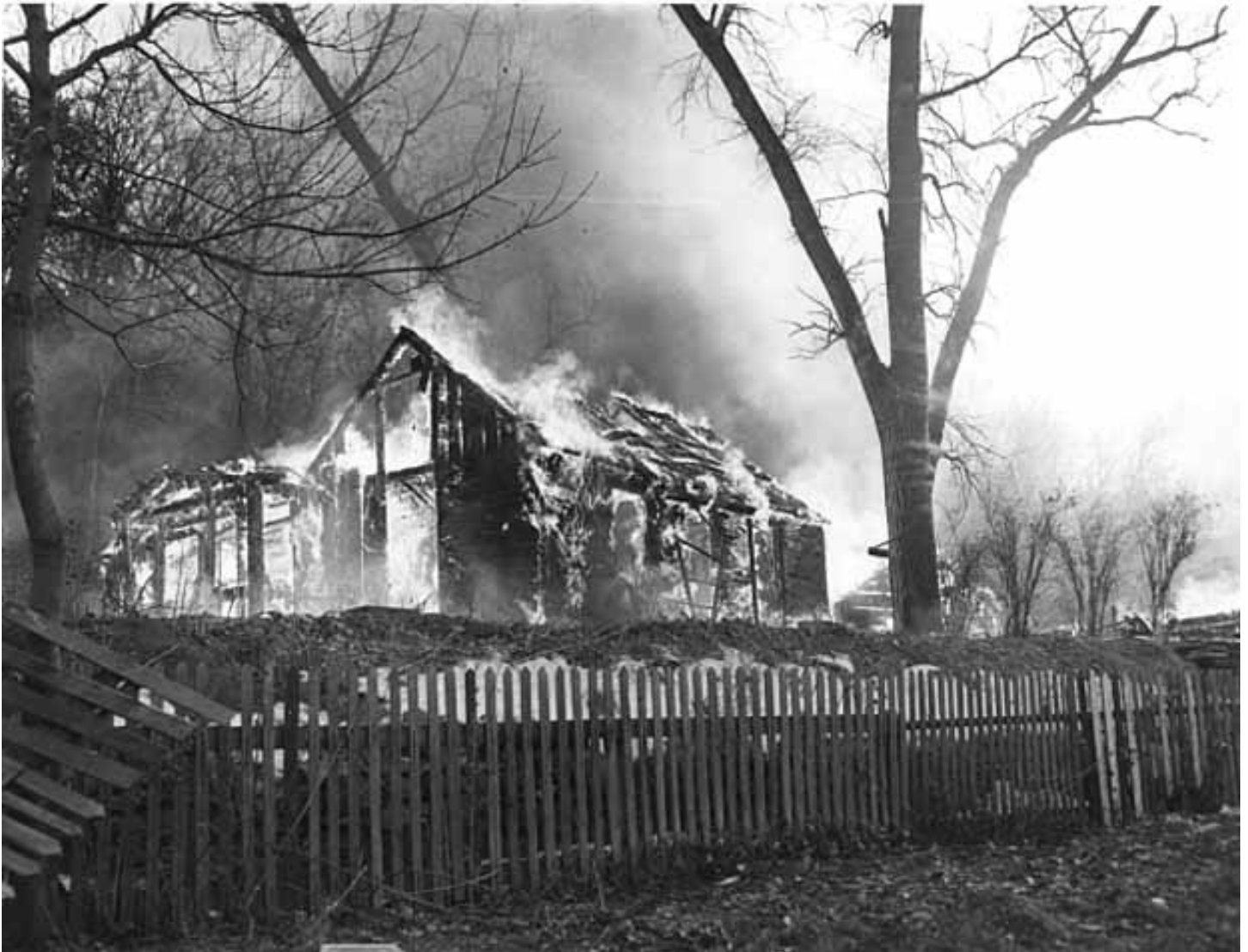
"Burning of Swede Hollow." St. Paul Dispatch and Pioneer Press, 12/11/56.