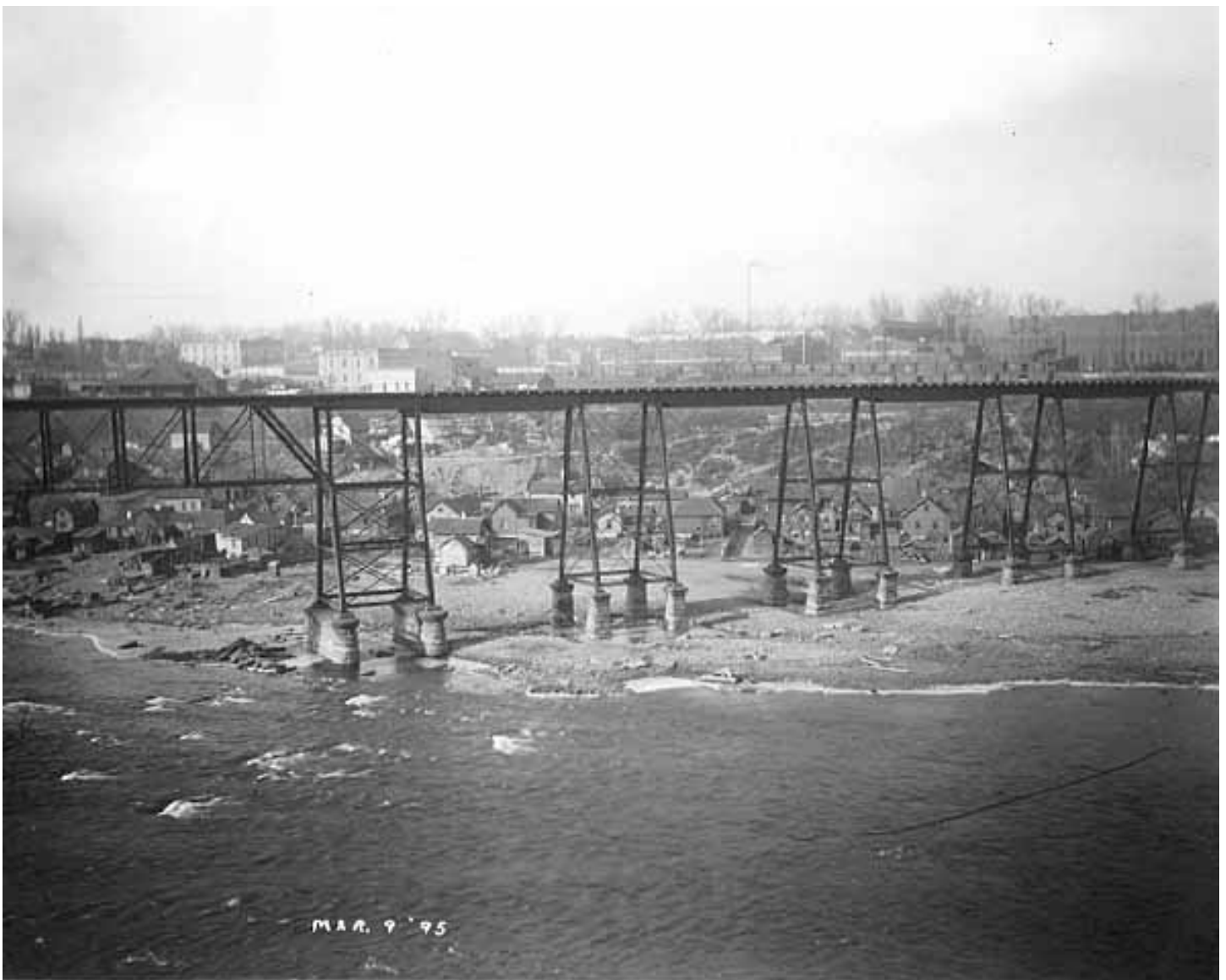
“Residential area on the east bank of the Mississippi River, Minneapolis.”

University of Minnesota Campus. Today, it is known as East River Flats Park and is the location of the boathouse for the school’s rowing team. The other, which I will call the East Side Flats, was located below the 10th Ave and 35-W Bridges between the Southeast Steam Plant and a heating plant used by the University of Minnesota.