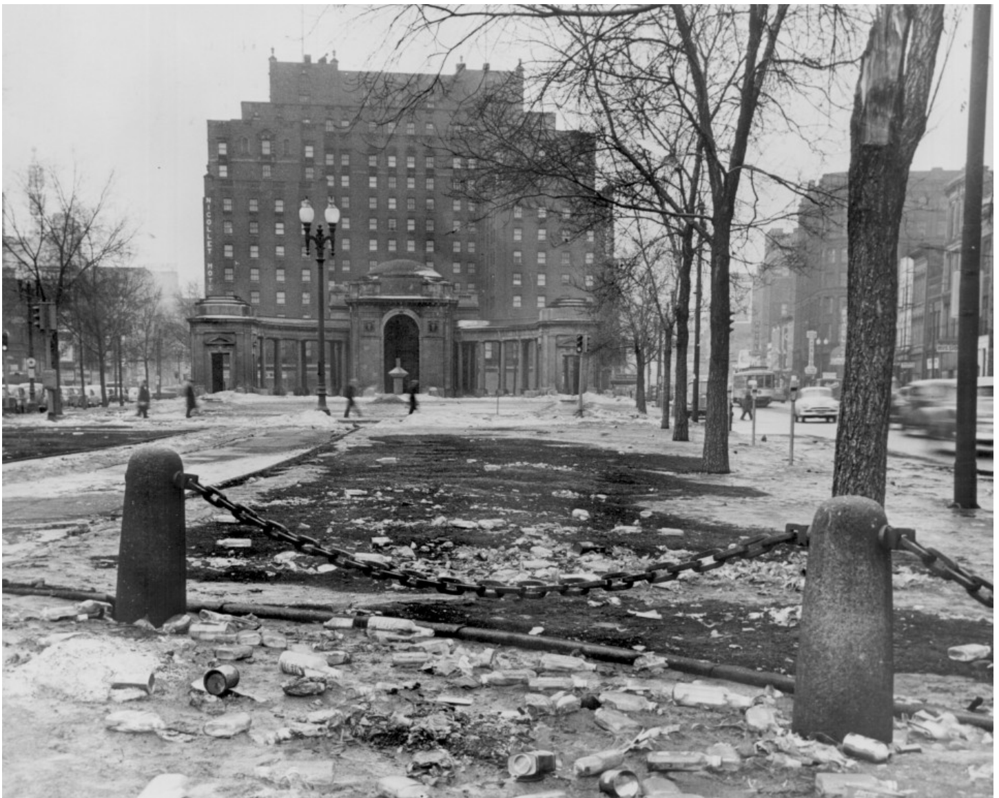
“Gateway Park and the Gateway Center just before it was razed.”

in poverty in small shacks and trailers. Local civic clubs wanted to evict the settlement’s 200 residents to create a public park, deeming them a “menace to public safety and sanitation.”[i] The comparison between the earlier and later river flats settlements made me reflective on the nature of memory. Why has history been so kind to the memory of communities like the Bohemian Flats and Swede Hollow, despite their notable problems? How do we choose which