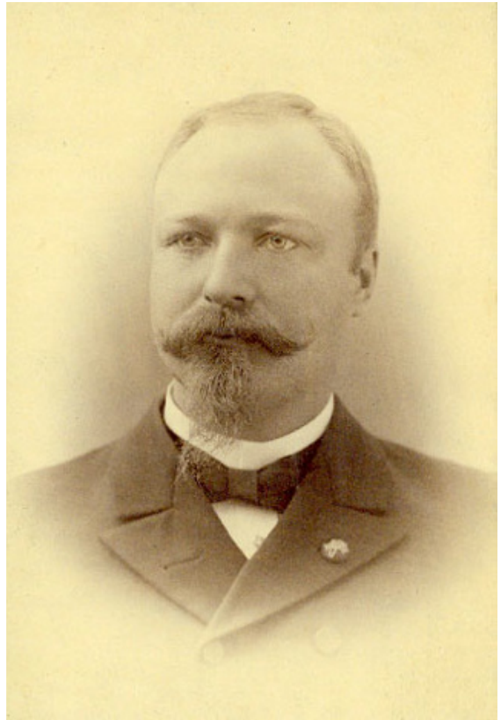
"S.S. Kilvington."

ed that city residents had been dumping their "cess-pools" (toilet waste) beneath the bridge in addition to trash. [vi] Around the same time, a similar dumping ground at the East Side Flats beneath the 10th Avenue Bridge was closed; however, it seems that these decisions were concerned solely with the water quality of the Mississippi River. The residents of these communities were rarely mentioned in the articles. Though one story discusses a petition from the Bohemian Flats residents asking to remove the dump from their community, the government, "recognizing nothing could be done at once," filed the petition and seemed to promptly forget the complaint. [vii]