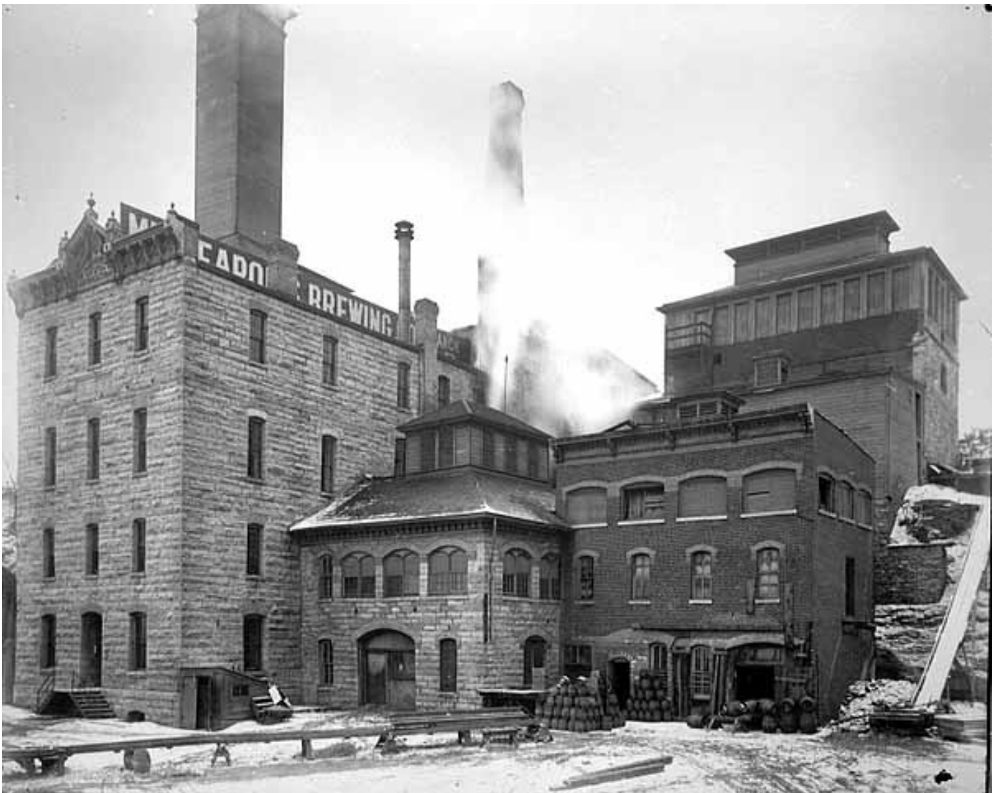
“Heinrich Brewery building (Minneapolis Brewing Company), foot of Fourth Street, Minneapolis.