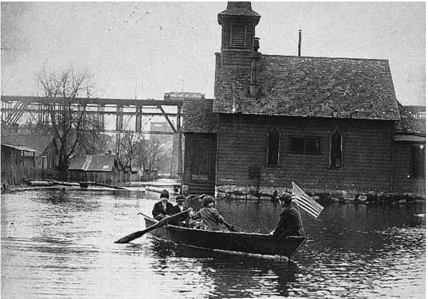
"Boys Rowing Boat Down Street in Bohemian Flats, Minneapolis." Courtesy of the Minnesota Historical Society, Taken in 1898, Photographer Unknown.

later, in 1941, the Writer's Project of the Works Progress Administration published a book about the Bohemian Flats which painted a picture of an idyllic, Old World community. The flats appeared diverse and inclusive, a place for residents of all ethnic origins to escape the busy life of the city, a retreat where traditional customs were maintained. This book has fostered an air of nostalgia and romance around the settlement.