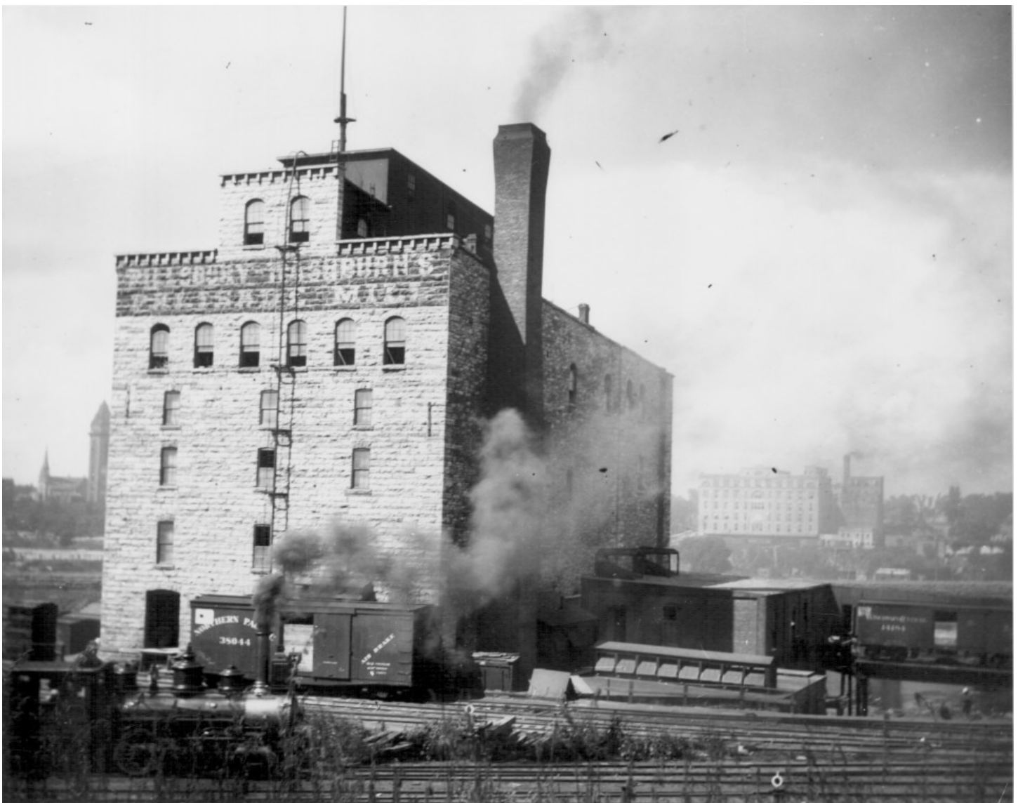
"Palisade Mill on the West Side of the River in 1903."