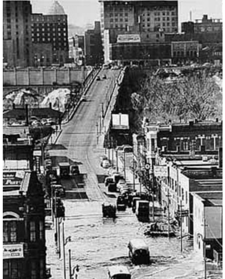
“View of flooding on West side of Wabasha Street Bridge, St. Paul.” Photographer unknown, taken in 1952. Courtesy of the Minnesota Historical Society.

Floods not only brought water into the homes, but debris, logs, and ice as well, which could cause irreparable damage.[iv] The river would also carry belongings away, including sheds and wood piles, and chickens would be found drowned after the water receded.[v] Though a flood wall was erected at the Bohemian Flats in the early 20th century, it did not do much to prevent flooding. Rather, it often trapped much of the water and silt behind it once the flooding subsided. One of the most devastating floods in the Twin Cities area took place in April 1952, leading to the evacuation of the entire Upper Levee community and portions of the West Side Flats.[vi] The rise in water level led to extreme property loss for both communities and prompted the city of St. Paul to consider new plans for the flats. This eventually led to the demolition of the homes on the flats and the repurposing of the land for industrial uses.