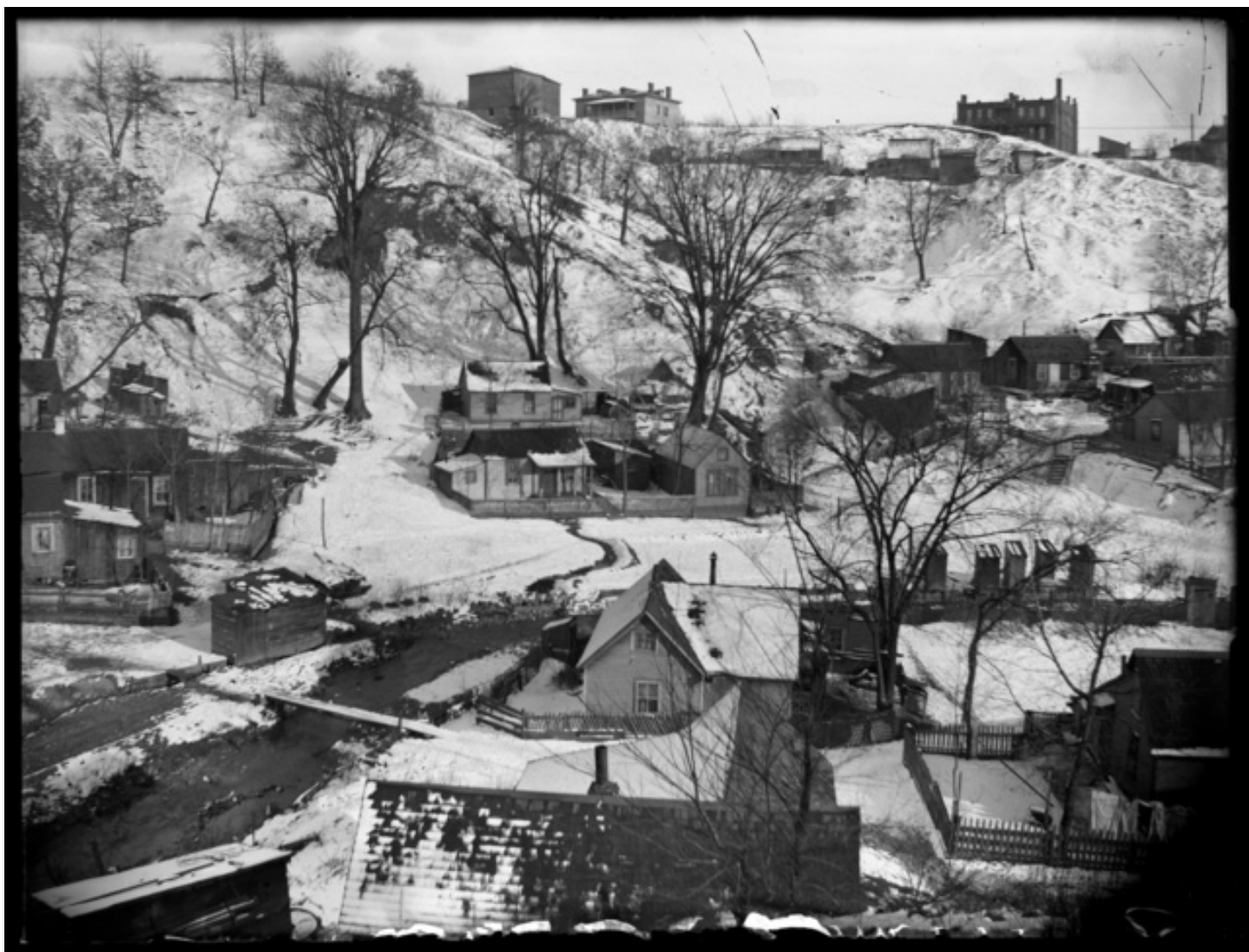
“Swede Hollow, St. Paul.” (Note the outhouses over the creek on the right side of the photo.)

Though the city of Minneapolis did not conduct an extensive survey like St. Paul, the Bohemian Flats was discussed in a 1915 examination of housing in Minneapolis. This report noted the limited supply of water at the flats,