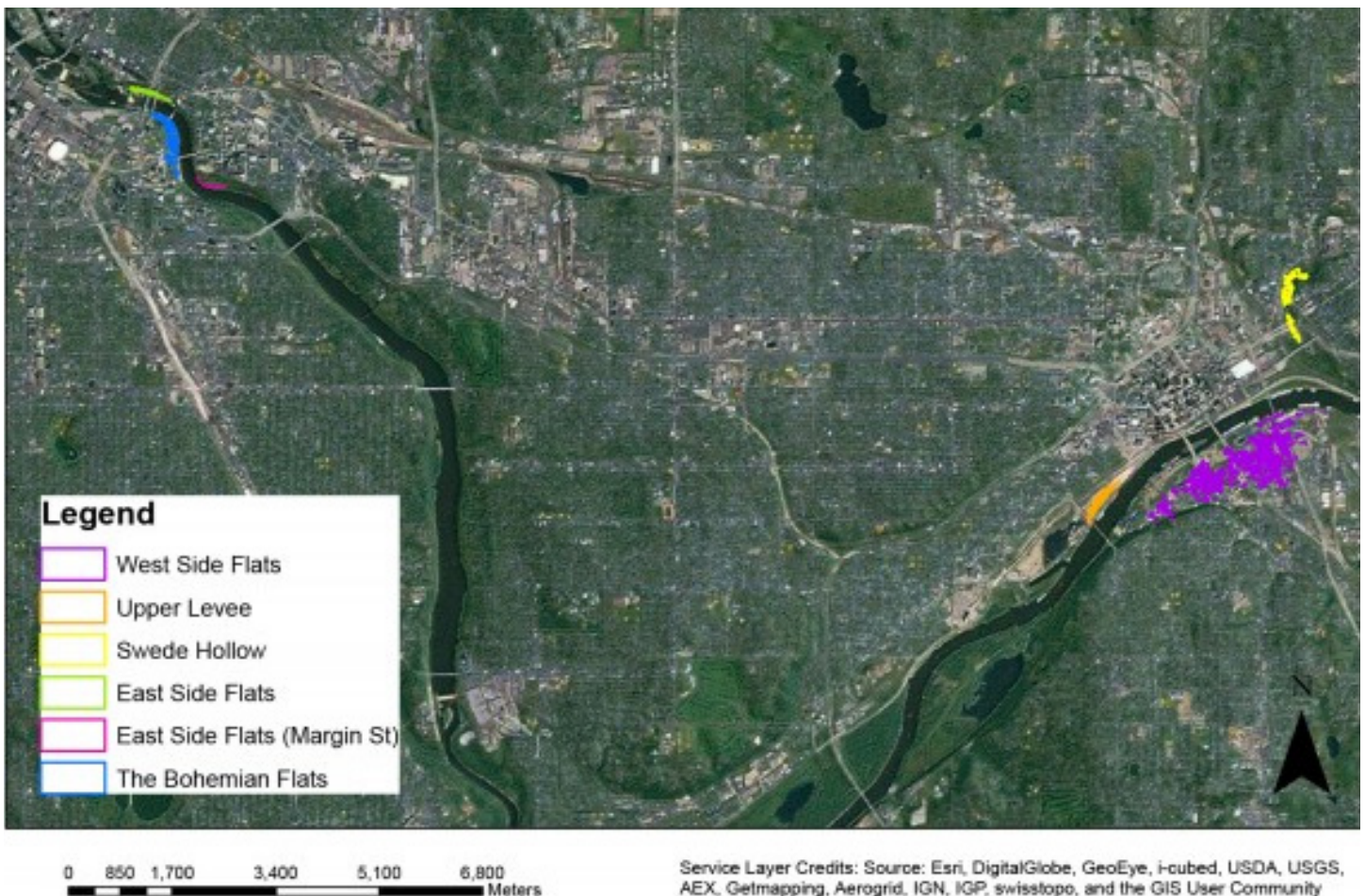
River Flats Communities Map, Created by Rachel Hines using Historic Plat Maps and Bing Maps, June 2014.

For the next few months, this series will examine the history of the river flats communities and what it means to almost literally live on the Mississippi River. Continue to follow along to learn more about life on the Mississippi prior to luxury condos and clean river water, before the riverfront was considered a desirable place to live.