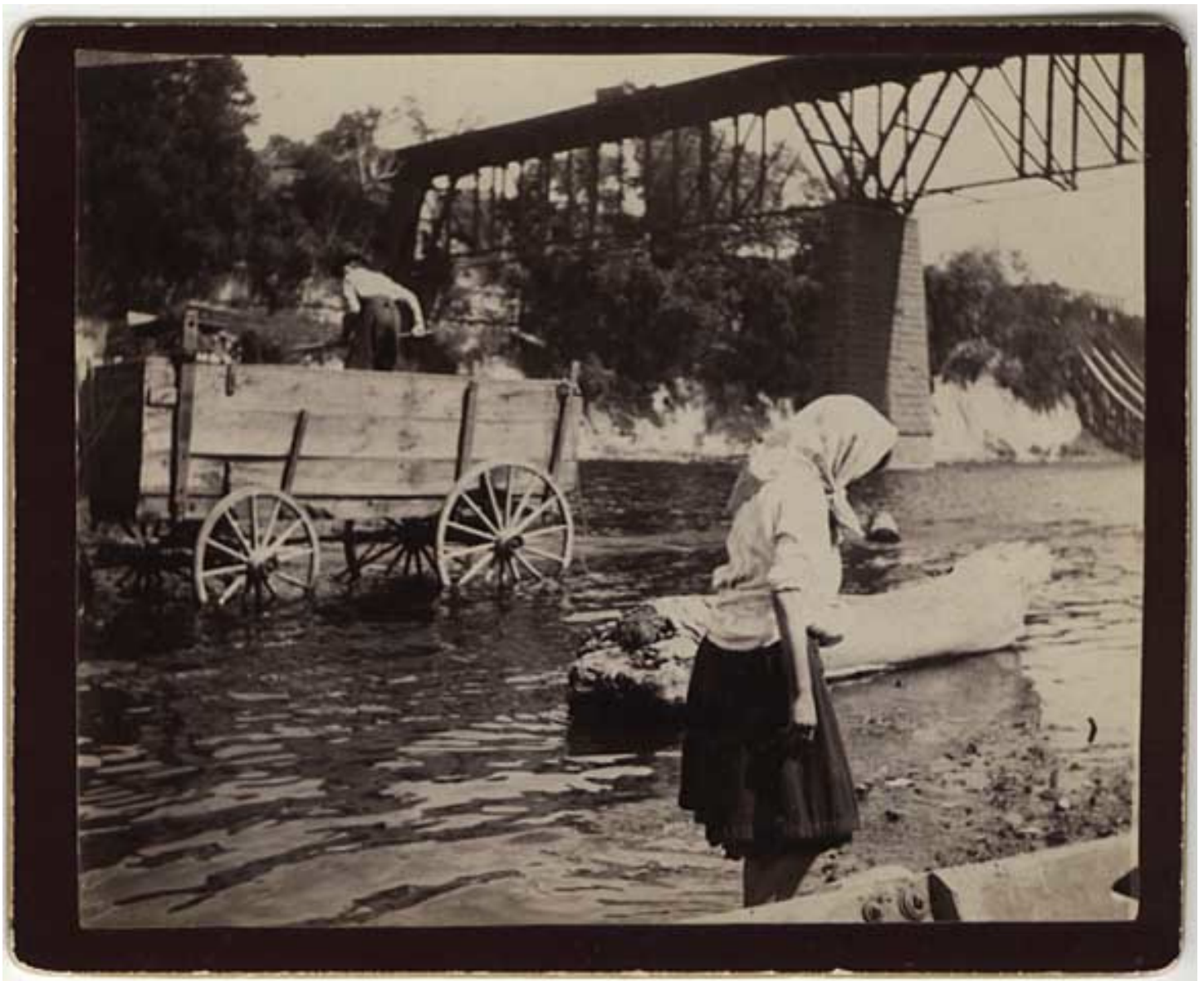
"Polish American girl and man with a wagon searching the Mississippi River shoreline near Bohemian Flats, Minneapolis. taken in approximately 1900.

The river was used to transport lumber from the saw mills upstream, which the residents at the Bohemian Flats were quick to capture. The WPA Guide to the Bohemian Flats notes that "They gathered the billets of wood, mill ends,