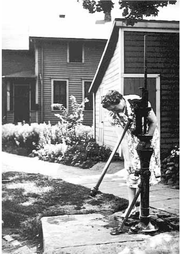
“Woman pumping water from pump on Bohemian Flats, Minneapolis.” Photographer Unknown, taken in approximately 1935. Courtesy of the Minnesota Historical Society.