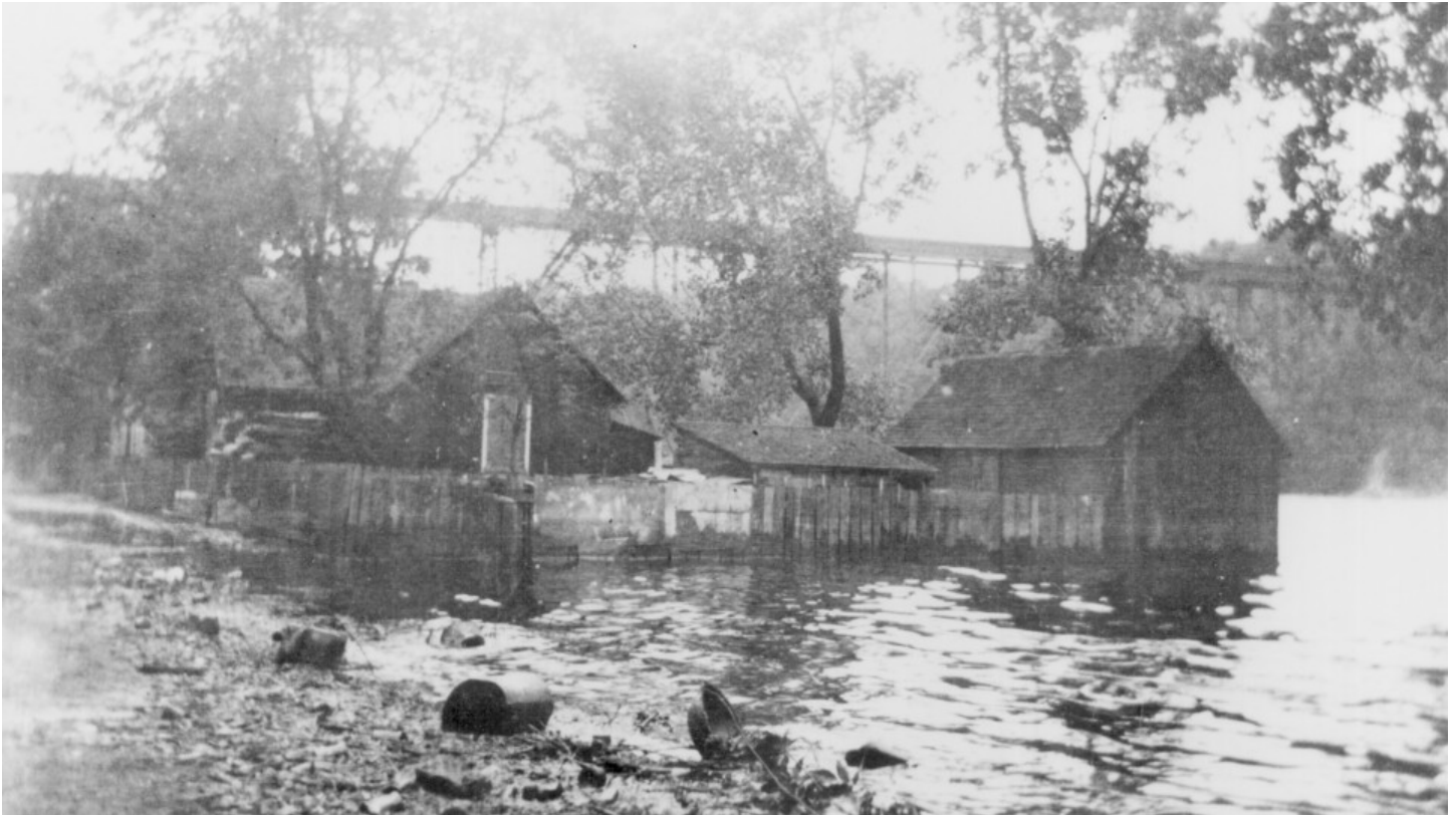
"Flooding in Bohemian Flats." Taken by Karen Bayliss in June, 1929. Courtesy of the Hennepin County Library. (Note the trash lining the banks of the river.)

The districts were rated and compared for a number of attributes, including access to city water, sewers, and bathing facilities, presence of ash cans or garbage cans, degree of crowding, amount of light and ventilation, and extent of rubbish on lawn. The flats communities consistently ranked