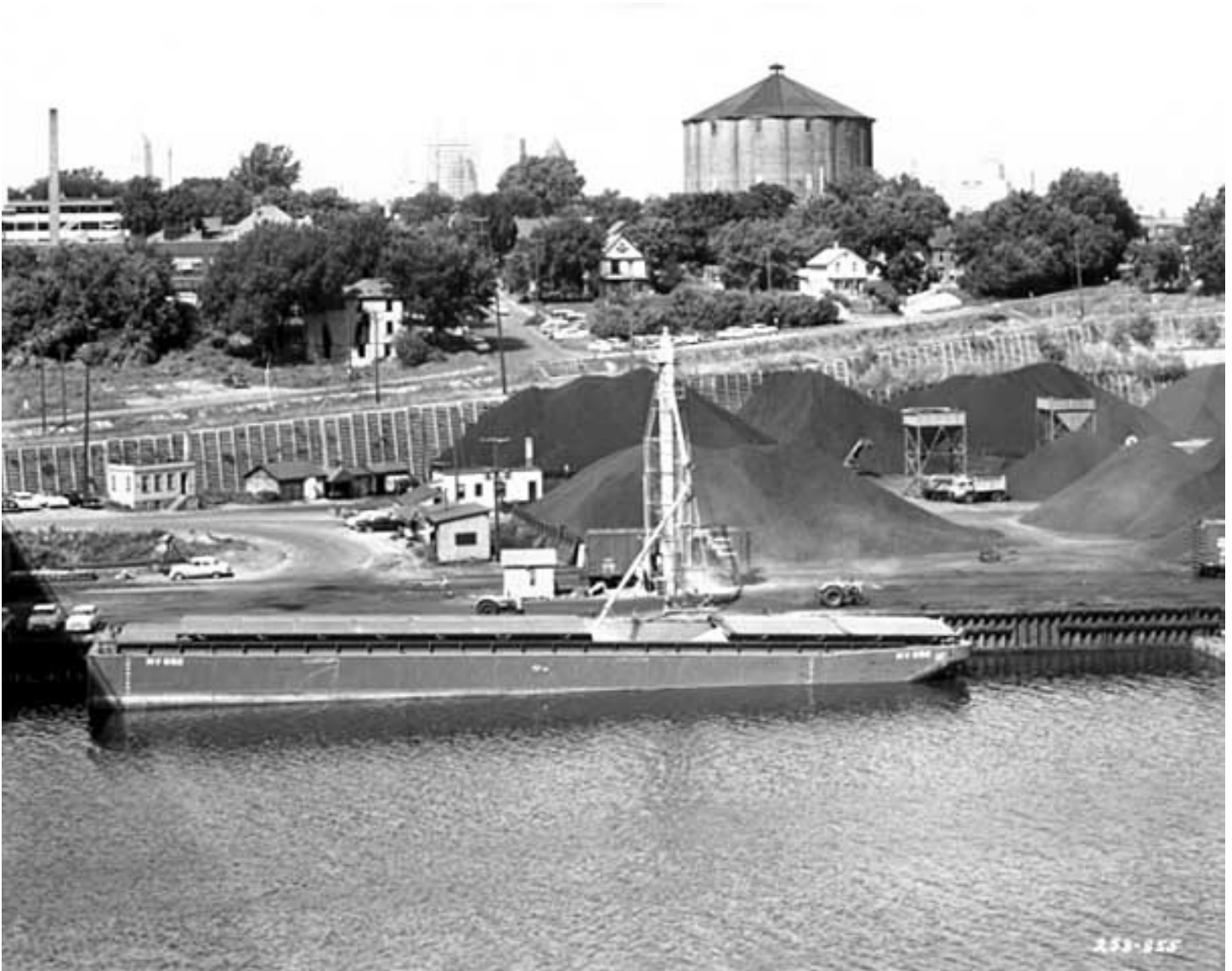
Barge at Municipal River Terminal, Minneapolis.

Wilder Foundation describes the West Side Flats, Swede Hollow, and the Upper Levee as some of the worst housing conditions in St. Paul and makes a few recommendations for their use, were the housing to be demolished and the residents relocated: "Phalen Creek and the banks of this stream are ideal for park purposes, while in their