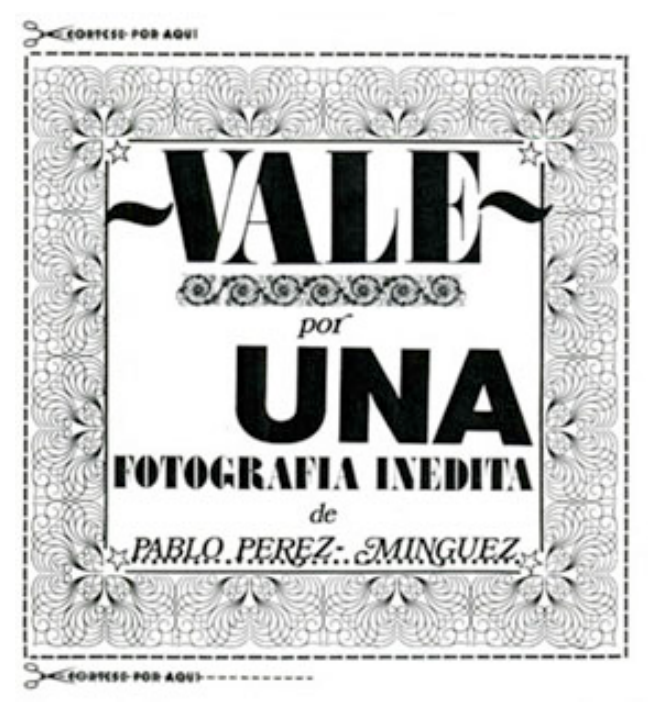
Fig. 3. Nueva Lente vols. 17–18.