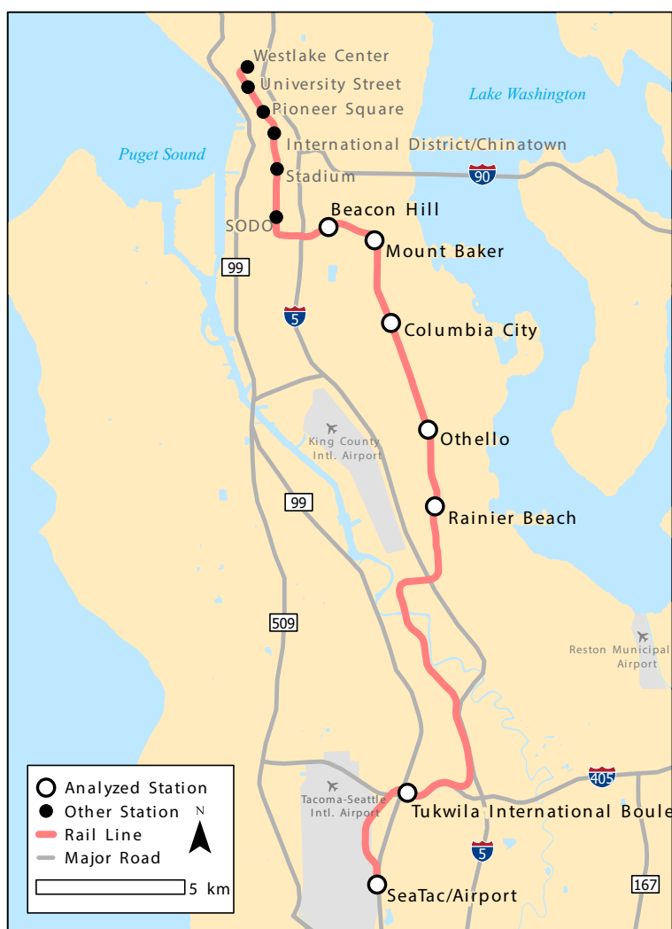
Figure 1: Seattle's Central Link light rail network during study period (Created by Brandon Whitney, ThinkSpatial)

This analysis focuses on the original 22.5-kilometer segment, which includes 13 stations. Figure 1 shows a map of the system. The six stations between SODO and Westlake are not located in residential neighborhoods—there are few, if any, single family homes within walking distance of these stations. Therefore, this study analyzes housing prices in neighborhoods of the seven southernmost stations of the line—from Beacon Hill to SeaTac Airport.