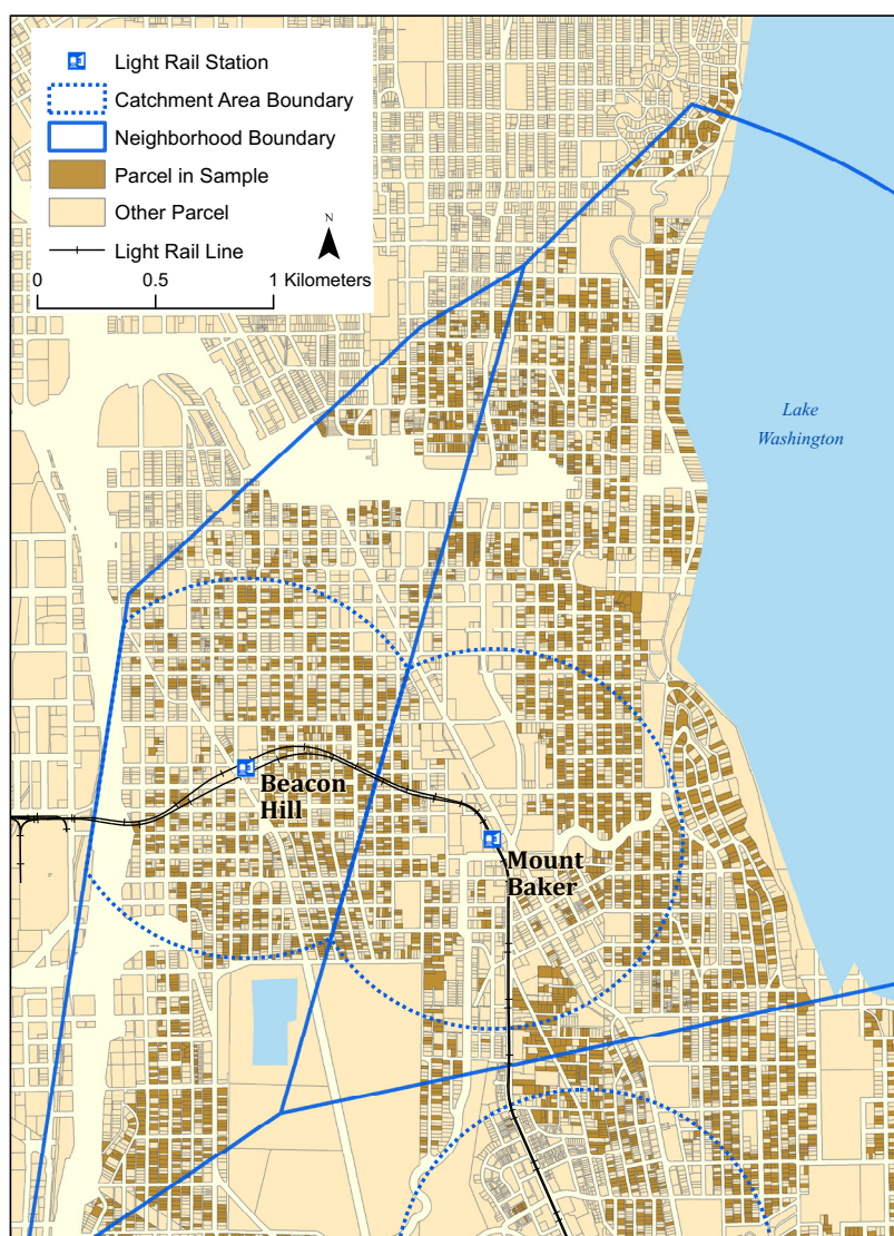
Figure 2: Study area detail—Beacon Hill and Mount Baker neighborhoods.

To account for housing price inflation, the sale price of each house is adjusted using the Case-Schiller price index for the Seattle metro area. 4 Thus, the analysis explains changes in the real relative price—that is, the price of houses in station neighborhoods relative to houses that sold in the same period in all parts of Seattle metro area. I have also explored estimating a hedonic price index, and the results obtained are very similar. However, using the Case-Schiller index simplifies the analysis while providing a well-understood benchmark.