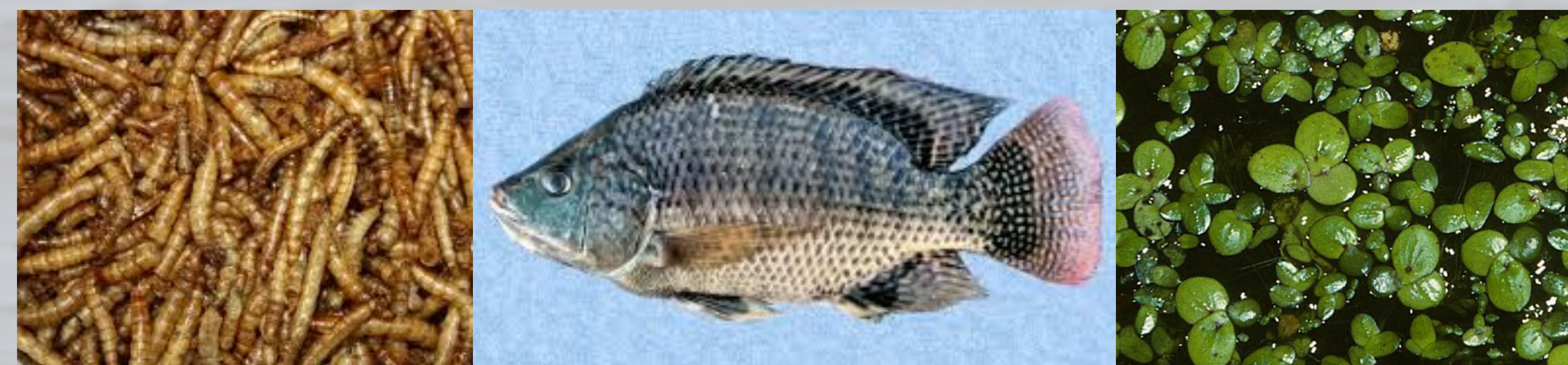
Figure 2: Mealworms, Blue Tilapia, and Duckweed