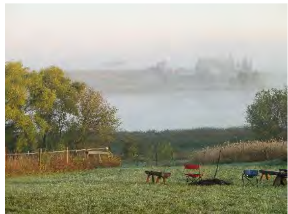
Foggy Marshwatch Farms

Whether they need a mobile home on the property or a few seasonal cabins, deciding what exactly is needed to support the CSA should be Marshwatch Farms first step. Preparing a rough sketch of the property with current and future planned buildings and a professional document about the farm and the needs it has, can be taken to the Planning and Zoning department in Scott County to provide a visual and reasoning behind the permit application. Marshwatch Farms must be flexible in design, location, and function as they move through the planning and zoning process.