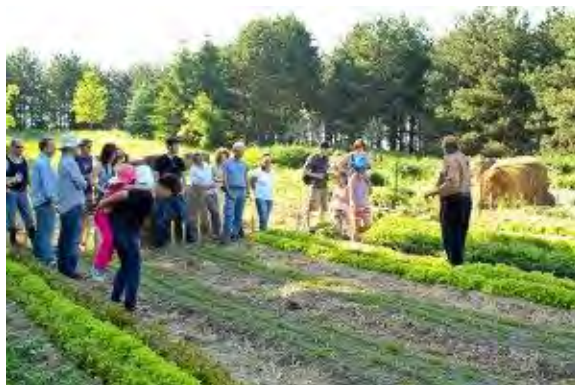
Dinner on the Farme at Garden Farme

His desire to continue Garden Farme extends beyond personal reasons; it is very unique to the area. It is a small scale certified organic operation with a focus on stewardship of the land. The diversity of land types on the site provides almost limitless agricultural uses, and would be an excellent location for an agricultural incubator, serving as a small regional economic generator.