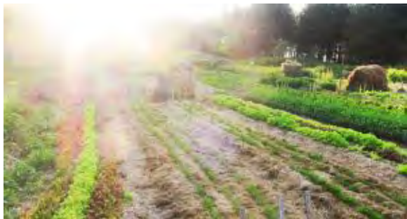
Raised Beds at Garden Farme

early 20 th Century. In 1977, Garden Farme was certified organic. The farm features two acres of raised beds for herbs and leafy greens. To complement the organic greens production, the remaining acres are used for growing potted trees, mushrooms, nuts, fruits, and honeybees. Additionally, the property has 25 acres of restored prairie and 16 acres in the Conservation Reserve Program. The products from Garden Farme are sold directly to local chefs, caterers, and cooperatives. Garden Farme also hosts many special events including permaculture education, Dinner on the Farm, and others.