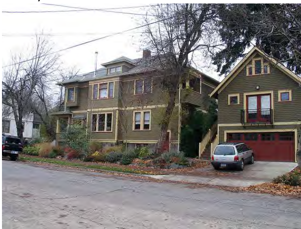
Attached ADU above a garage.

Agricultural zoning districts can be used to direct how and where future development occurs. With agricultural zoning it is common to see large lot sizes (one unit per twenty acres or larger) and restriction on uses. Major overhauls to agricultural zoning ordinances may see pushback from farmers because much of their livelihood is dependent on the use of their land. To ensure agricultural zoning is legally sound, the zoning authority should communicate how the ordinance serves the public good and is backed by a current comprehensive plan. Furthermore, the zoning cannot result in a regulatory taking of the property and thus should be reasonable, inclusive, and fair (Bowers & Daniels 1997).