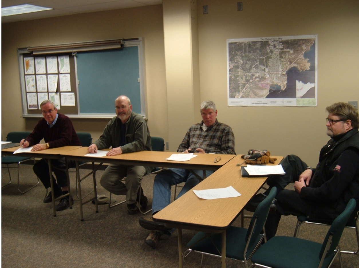
Some board/committee members of the band Shell