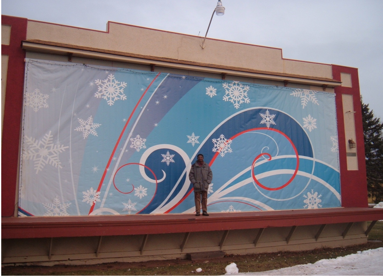
Current structure of Two Harbors Band Shell

The scope of this work will be to develop a site plan and make a exterior architectural revisions to the proposed building for fundraising purposes. Deliverables will be a graphic presentation of site plan, building elevation on a 24" x 36" foam core board. Landscape design will be completed by SAS associates.