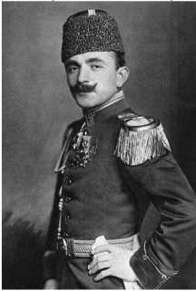
Enver Pasha (1881-1922)