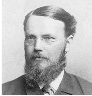
Johannes Lepsius (1858-1926)