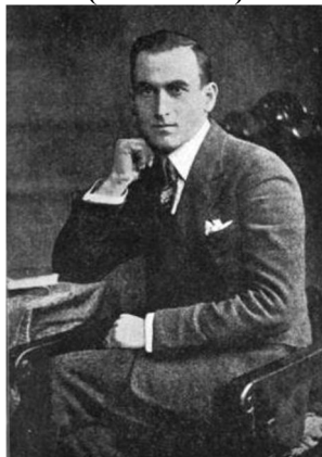
Soghomon Tehlirian (1896-1960)