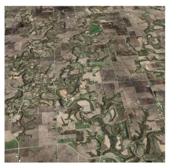
Google Earth image of an incised portion of the Blue Earth Watershed south of Mankato, MN

As large as this natural background sediment supply has been, the rates of soil erosion and sediment supply increased five-fold as the region was developed for row-crop agriculture in the late 19th Century and into the 20th Century. Despite extensive improvements in soil conservation over the past 80 years, this high rate of sediment supply continues today. As the amount of sediment from upland soil erosion diminished, the amount of sediment derived from the steep bluffs along the river channels increased over the last half of the 20th century. The largest source of sediment shifted from fields to the banks and bluffs along the incised river valleys. The cause of this increase in nearchannel sediment supply is an increase in river flow. Higher flows produce deeper water and swifter currents, as well as more channel shifting that can direct erosive flows against the channel banks and bluffs. As we evaluated solutions to reduce sediment loading, we considered not only actions to reduce upland soil erosion and stabilize bluffs, but also actions to reduce the peak river flows.