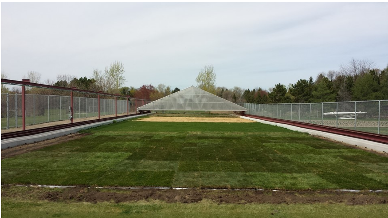
Figure 5.1. Rainout shelter used to evaluate water regime treatments in St. Paul, MN.

Based off of data from this experiment and our own observations, turfgrass professionals establishing MNST-12 from sod will need to adjust their watering regime from MnDOT's recommendations in order to ensure a successful establishment. A water savings (and other potential economic savings) may be realized if the sod is watered to replace 60% ET. Further investigation is likely needed to determine the feasibility and effectiveness of watering programs for roadsides based on ET rates. Across the two experimental years of 2015 and 2016, pre-wetting the soil prior to sod establishment did not improve establishment of either Kentucky bluegrass or MNST-12 sod.