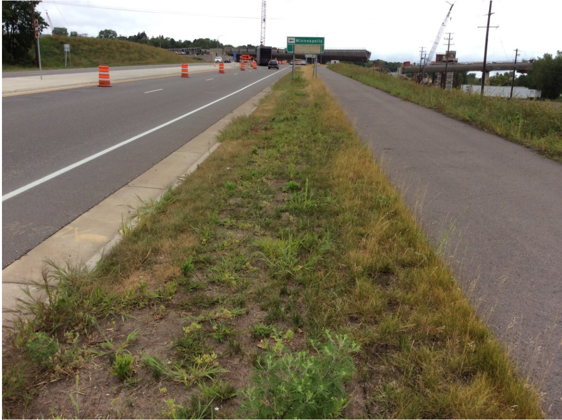
Figure 2.2. Image of a failed establishment that was evaluated in Stillwater, MN.