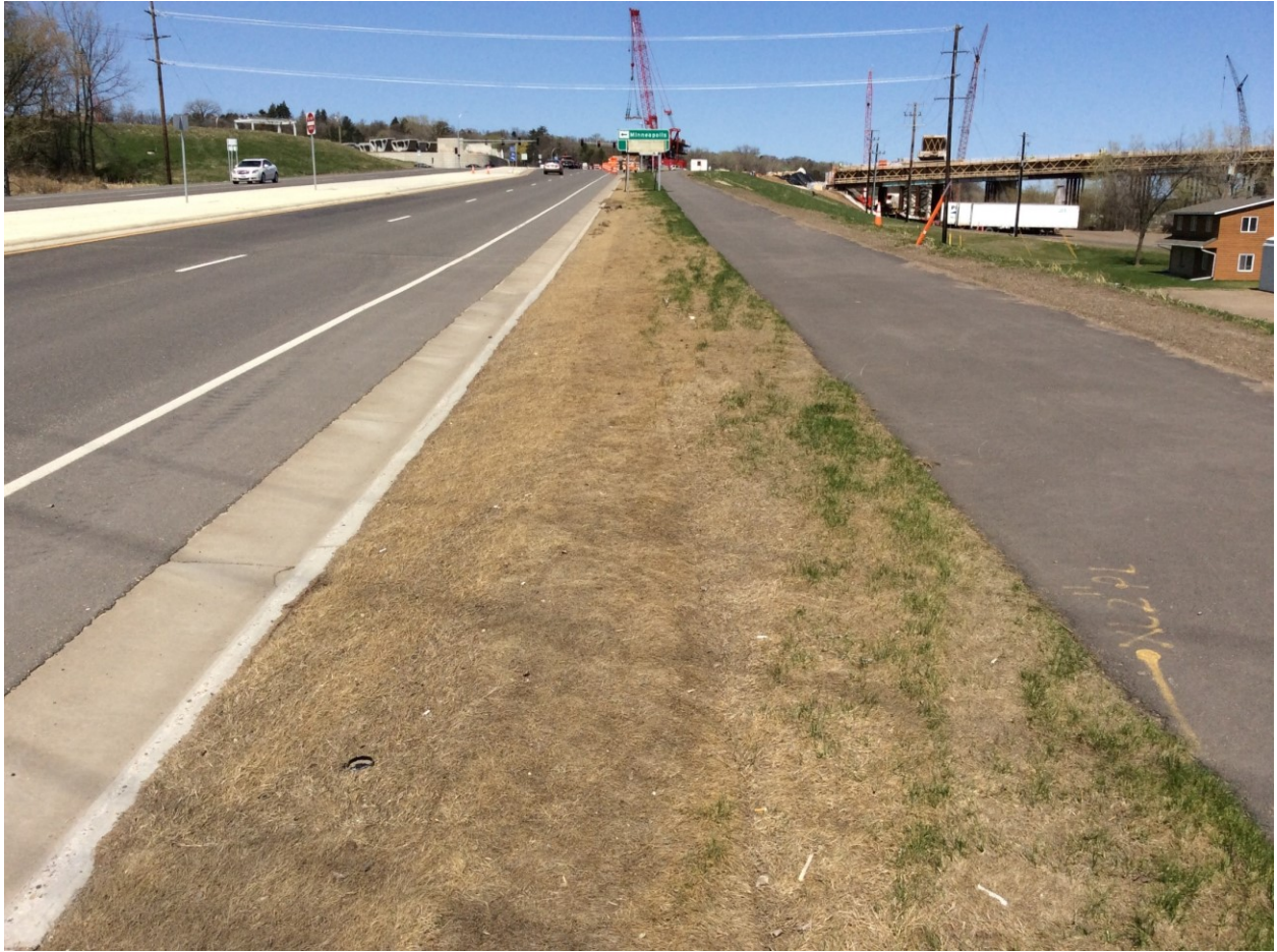
Figure 1.1. Photo of failed sod establishment of Kentucky bluegrass adjacent to a road entering Minneapolis.