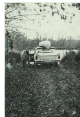
One of the smaller access areas is on the St. Croix River provided by a public power company.