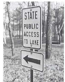
40 years to get to the lake?

The Commissioner was given the authority to mark the routes and work with agencies and private owners to secure land and develop recreational facilities. xvii While the bill reflected the national and statewide support for the expansion of outdoor recreation, it was an unfunded mandate. The Commissioner believed this was still a step in the right direction, as it laid the groundwork for the development of a recreation system on rivers, which, previously, had primarily been considered only for their utilitarian uses. xviii Additionally, the