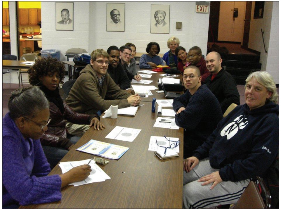
North High Community Coalition members meet at a local church in December 2010 to discuss and organize their ongoing efforts.

Lesson 2: Not All Constructions of Poor Students’ Interests Are Equally Compelling. Some are downright bad,