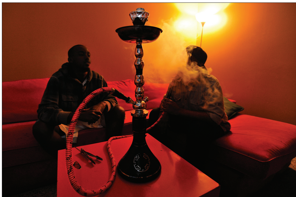
Waterpipe smoking has become a norm in Minnesota Somali and Oromo communities among both the young and old, and is commonly used at social gatherings in homes with both family and friends.