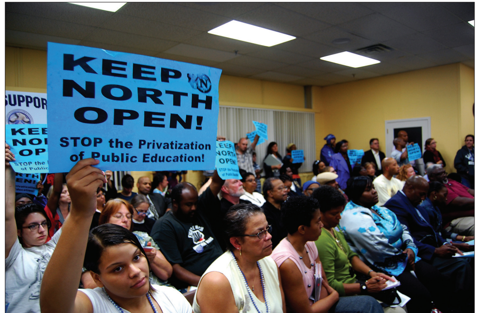
North High supporters at an MPS community meeting, protesting the proposal to close the school. The message on their signs—"Stop the Privatization of Public Education!"—conveys one of the multiple constructions used by members of the North High Community Coalition.

students by closing failing schools and expanding school choice, most often in the form of open enrollment or charter schools. However, by stressing school performance per se as the primary influence on poor students' educational outcomes, these efforts have obfuscated the manifold challenges that surround them.