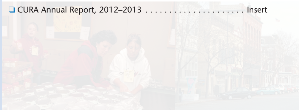
Photo on Cover: Children at a daycare center (photo illustration).