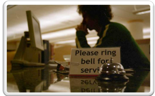
A student employee works at the third-floor Help Desk.

Rachel Heinrich worked at the UMD Library as a student employee from the fall of 1989 through the fall of 1993. She started in the Reserves department in the health science section of the old library and later worked in the Reserves/Multimedia area near the main circulation desk. Her duties included shelving the very heavy medical journals (which all looked the same to her), lots of computer processing of Reserve materials, two summers of barcoding, calling students about overdue Reserve materials, and monitoring the multimedia stations.