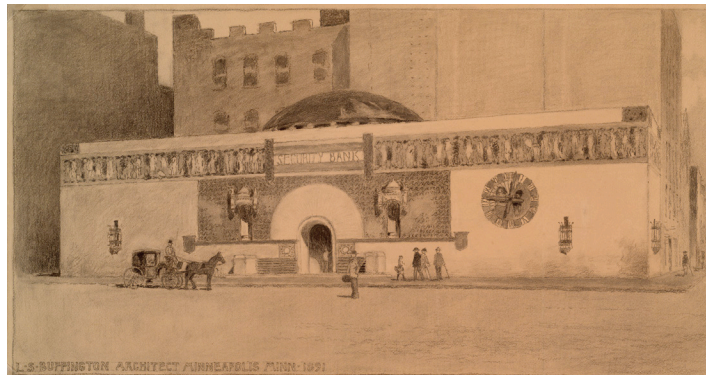
Architectural drawing for the Security Bank (Minneapolis), 1891 by Harvey Ellis and Leroy S. Buffington

The Northwest Architectural Archives contributed to MDL during our first year of operation, Phase 1 in 2003. Their early contributions include the architectural drawings of Harvey Ellis (1854-1904) and Leroy Buffington (1847-1931). Most recently, Barb submitted a series of black and white photographs that document all of the Minnesota movie