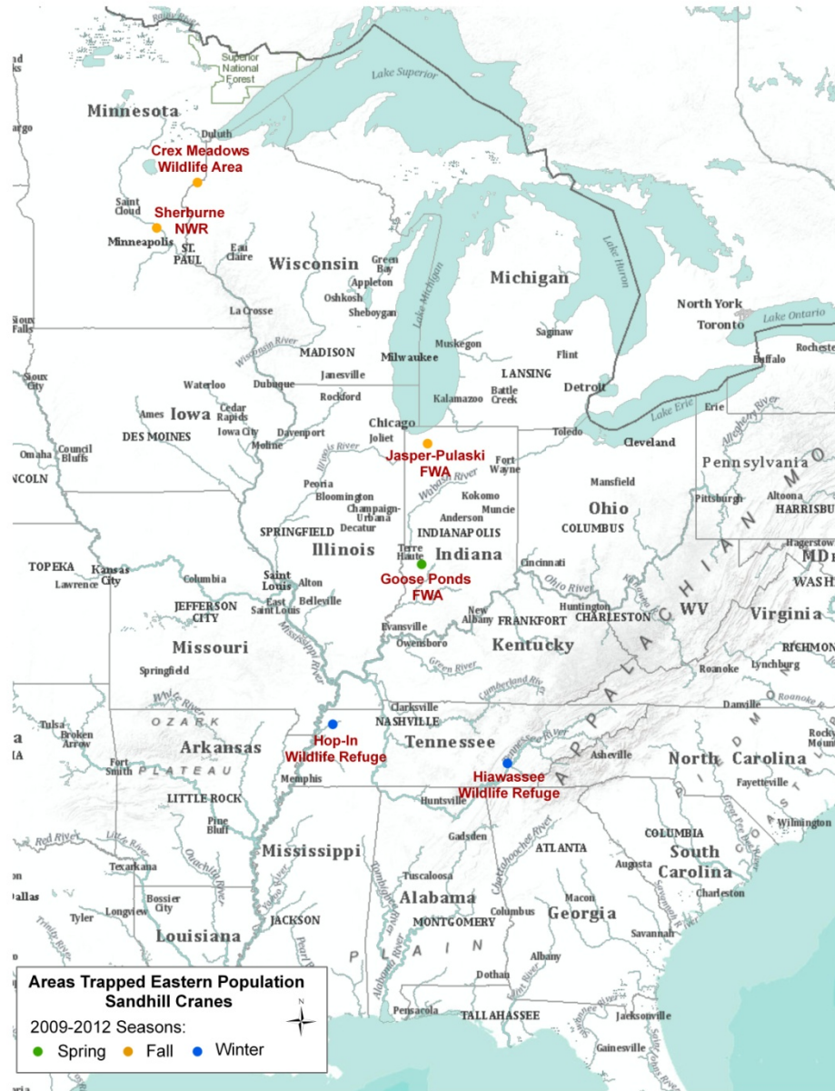
Figure 2. Eastern Population sandhill crane trapping locations in Indiana, Minnesota, Tennessee, and Wisconsin.