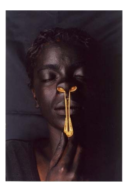
"Colonizados" from the series Objetos para deformar Photographic color self-portrait with gold filigree nose piece Artist's Portfolio, 1999

exaggerating the features of the black body with sculptural props that the artist created (a 'cephalic deformer' and a 'lip shaper' for example) in order to suggest other real historical artifacts that have been used by Colombian blacks to whiten their bodies. In the self-portrait "Colonizados" (Colonized), for example, the gold filigree nose piece and blackface make-up serve to broaden her nasal passages and embellish the phenotypic aspects of her blackness. As an object the nose piece imitates well-known indigenous Muisca gold filigree, but as Angulo explained, it is also intended to evoke similar plastic objects that Colombian blacks have bought and used in order to "respingar" or straighten out their noses (interview with the artist, August 2007). As such the nose piece constitutes a type of archeological anti-artifact in a performance of self-representation that makes visible the dynamics of mestizo competency and the corporal and cultural plasticity it demands from Afro-Colombians.