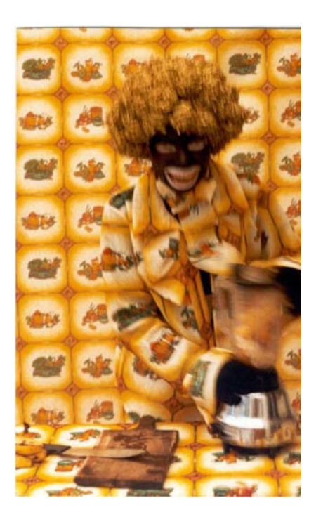
Negro Utópico (fragment 5) Color photograph, self-portrait polyptic in 9 images Artist's Portfolio, 2001

spontaneous, exotic, and sensual subjects with others more provocative and threatening whose expressions reveal the awareness of being observed objects. In fragment 5 of the series of self-portraits Negro Utópico from the exhibit Viaje sin mapa (Bogotá 2006) Angulo works to estrange and defamiliarize stereotypes of the black domestic: the artist/model is in blackface, she wears an exaggerated wig made of spun-metal kitchen scrub pads and wears a suit made from the same cloth used for the wallpaper and tablecloth. This semiotics of the domestic is combined with the flattening effect of the repetition of colors, the pattern in the cloth, the lack of depth of focus and an exaggerated pose that suggests dance and blissfully ignorant happiness. At the same time, however, there lies within easy reach a knife known as una champeta, the name for which simultaneously signifies the knife used to clean fish by the mostly black fishermen of the Atlantic coast, the stereotypical loud voices and shouting of blacks, and the name of a 'hostile' form of black music listened to at great volume in the most humble neighborhoods of Cartagena.