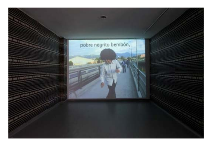
"Pobre negrito bembón" (Poor Big-Lipped Negro) From the installation Négritude Artist's Portfolio, 2007