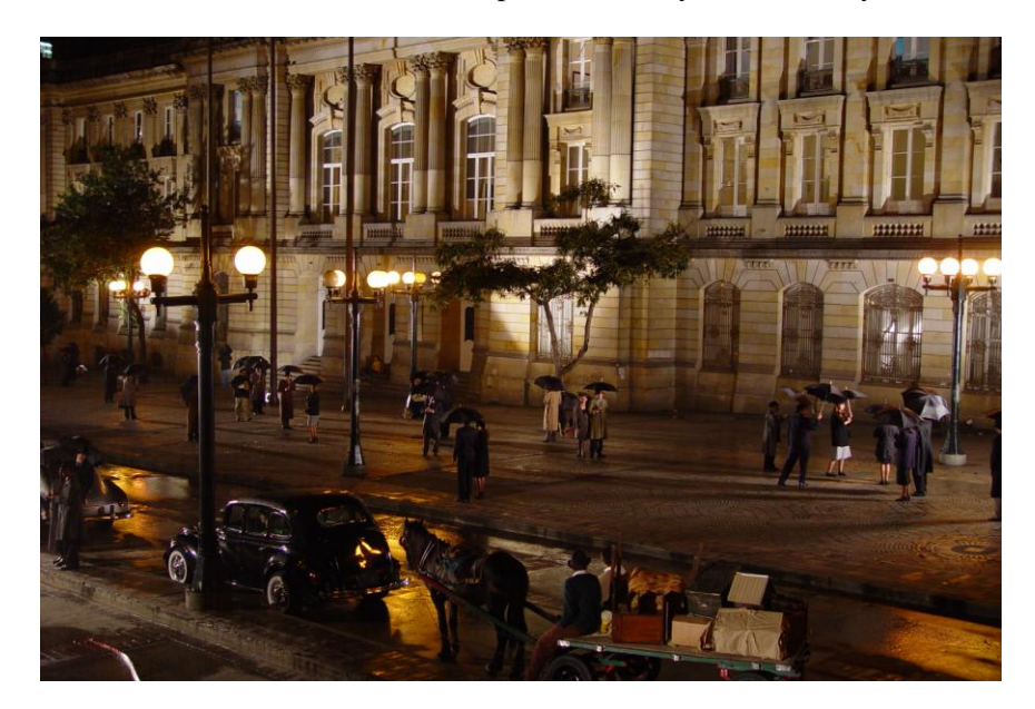
Church of San Francisco (Calle 13 and Carrera 7) in La historia del baúl rosado

that—to quote Kevin Lynch—is "rendered fragile by the passage of the twentieth century and unsatisfiable by the continued transformation of cities into centres of consumption and images of desirable 'lifestyles'"(6). In La historia del baúl rosado (and even in Soplo de vida ), the elements needed to achieve that nostalgia become artificial insofar as the set design must resort to reconstructing a city that is gradually disappearing. In both films, the representation of Bogotá with its emphasis on the Centro can be read as an act of persistence of memory that has become cinematic and that confirms the endurance of urban memory in the face of the city's changes. In La historia del baúl rosado , however, the closing sequence winks at the spectator by abruptly depicting an image of contemporary Bogotá. In this sense, the film narrative becomes a spectral memory of the old city.