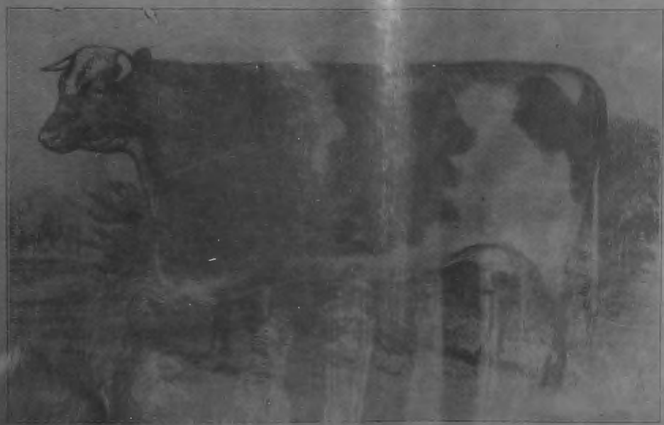
DUCHESNE, by LARSY BULL (186); bred by Chas. Colling.