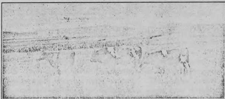
Fig. 3. Sweet Clover Pasture a Success at Duluth for All Classes of Livestock

Variety test work can best be illustrated in tabular form. The several varieties were sown in May, 1923, on limed soil in consecutive order and without a nurse crop. Sweet clover was used for inoculation. All varieties were grown in triplicate plots. Cossack and Baltic were of South Dakota production. As its name implies, Ontario seed came from Canada. Hardigan came from Michigan. Grimm seed was produced in Minnesota, and Northern Grown common was grown in the Northern Great Plains alfalfa seed district.