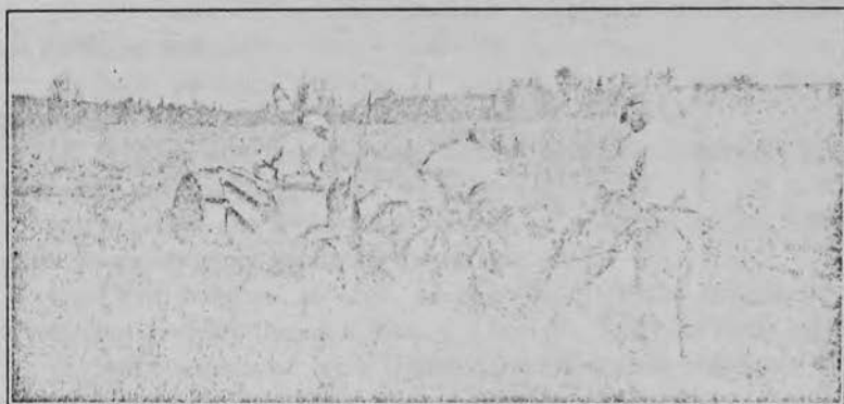
Fig. 8. First Breaking of Swamp Land for Farm and Garden Crops. Photograph taken July 31, 1925.

In the establishment of the Lake County field, at the Lake County Farm, Two Harbors; and of the Biwabik field on the Hanke farm south of the village of Biwabik, this station began a new service in 1924. This work was extended in 1925 to include the Virginia field, located