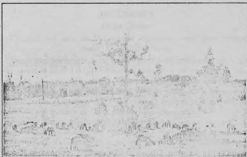
Fig. 1. Animated Lawn Mowers at Work on the Duluth Campus

This report is a summary of the experimental work in progress at the Northeast Experiment Station, located near Duluth, for 1924 and 1925, together with a progress report on the development and expansion of the institution during the same period. It is the eleventh publication in the series prepared since the establishment of the station in 1912. The first nine are enumerated in the 1922-23 report, and most of them are still available. The tenth in the series, University of Minnesota Bulletin No. 220, "Effects of Forest Fires on Land Clearing and Crop Production," was released in May, 1925. Numerous press articles only, were released in 1924, as the institution is now committed to the policy of biennial reports. In 1925 the Board of Regents of the University gave official sanction to the shortened name, "Northeast Experiment Station," which has been used in general practice for a decade.