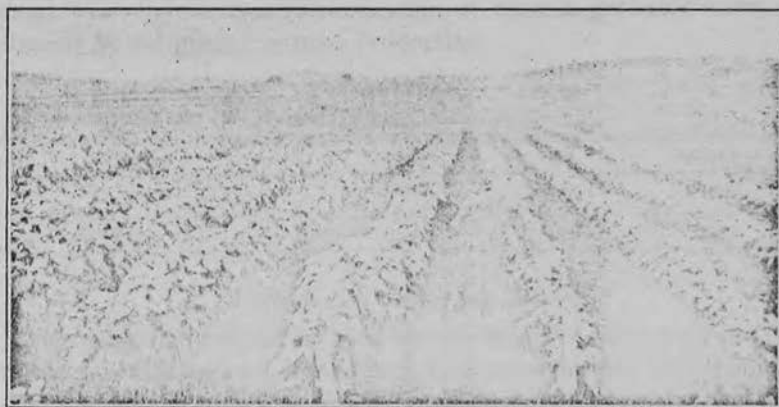
Fig. 4. Date of Planting Tests with Sunflowers

Five years' experience justifies the practice of sowing sunflower seed as early after May 10 as weather and soil conditions permit. The nine crops grown have never yet suffered from spring frost. The greatest danger is from the soil packing because of excessive moisture. In this district of short seasons and limited clearing, very early seeding is almost indispensable in insuring sufficient winter silage of good quality.