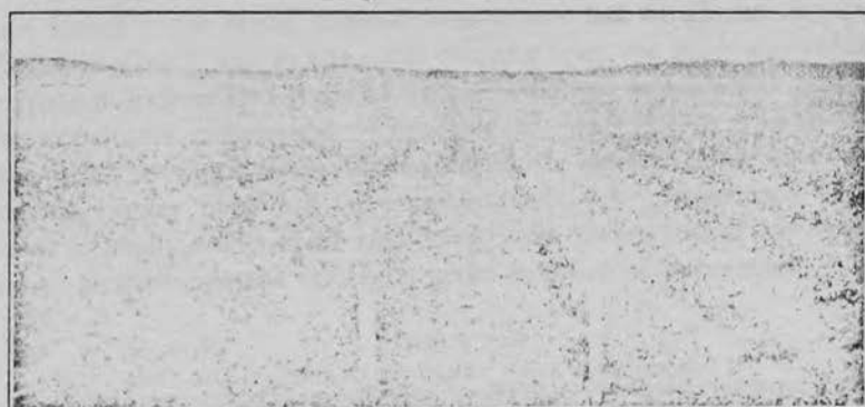
Fig. 5. Date of Planting Tests with Potatoes

The four small rows at the right were planted on July 1, and yielded 92 bushels per acre; the blossoming rows beyond, planted May 15, yielded 269 bushels; the four rows at the left center, planted June 15, yielded 161 bushels; the blossoming rows at the extreme left, planted June 1, yielded 227.6 bushels. Photograph taken July 31, 1925.