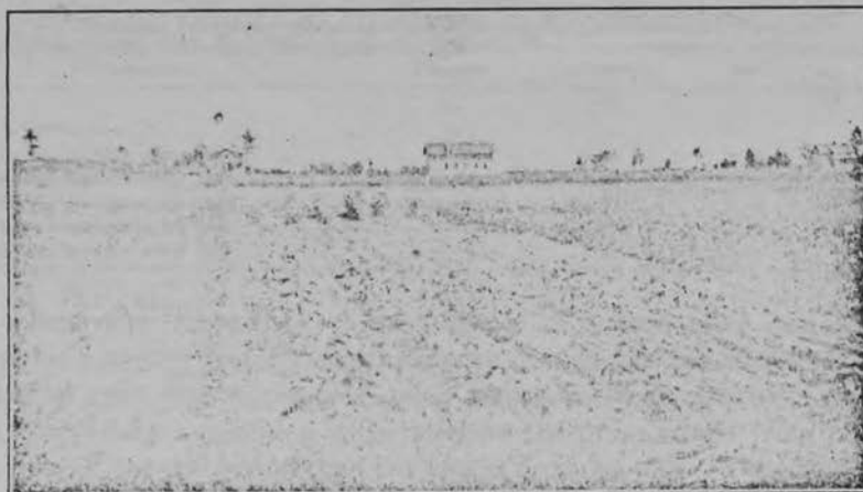
Fig. 6. Rotation Without Clover or Manure

Without clover-grass sod or manure, barley is a failure; sunflowers fail to germinate; oats and potatoes decline in yield. Photograph taken July 31, 1925.