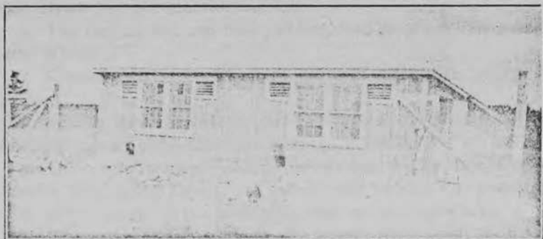
Fig. 7. New Poultry House

Experimental work under way consists of temperature studies, comparing inside temperatures for this type of construction with those obtaining outdoors; and a study of production with and without artificial light. This will continue through one year, and is being conducted in the 18x32-foot Minnesota model house similar to the one described.