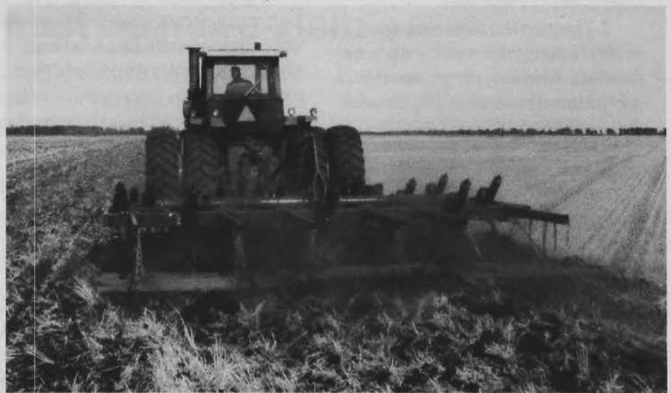
Economics is driving farmers to adopt minimum tillage methods.