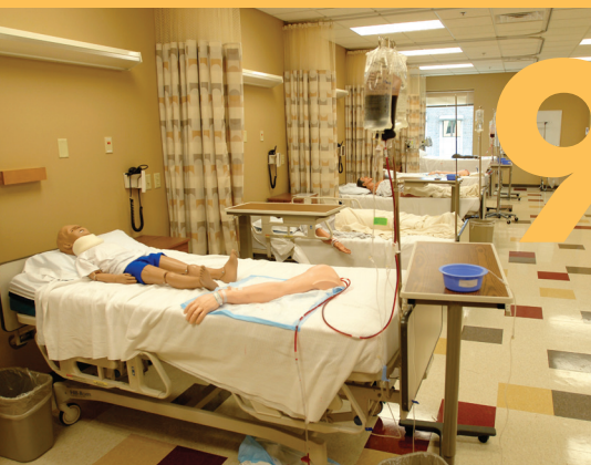
Rochester campus medical classroom