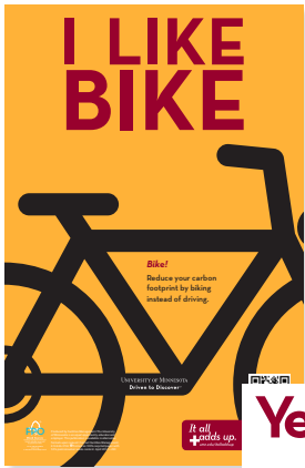
"It All Adds Up" campaign