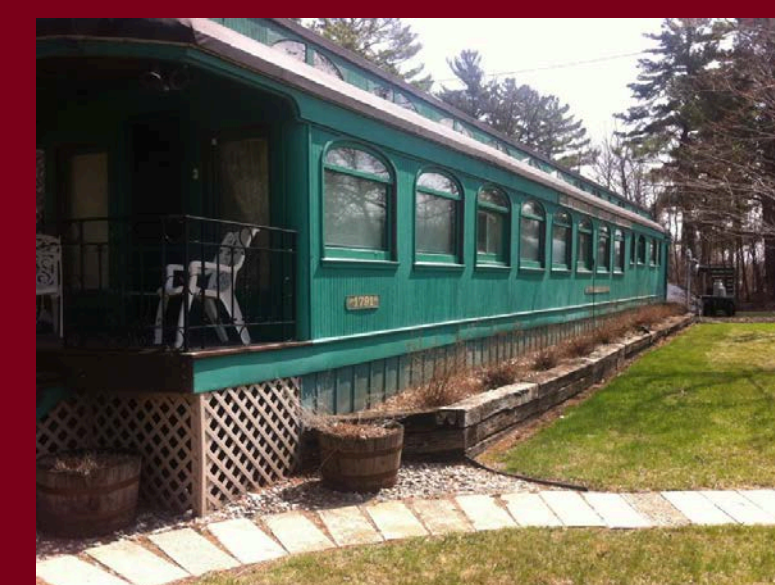
New York Mills