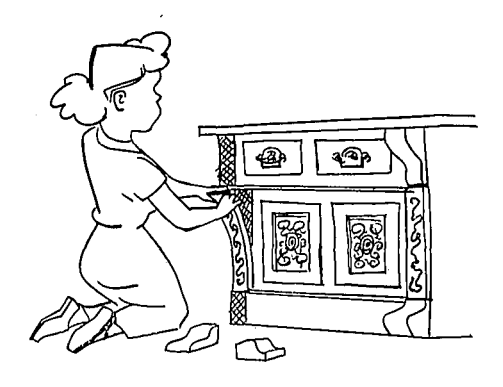
Remove undesirable ornaments.

All necessary repairs should be made before refinishing but only the simplest ones attempted at home.