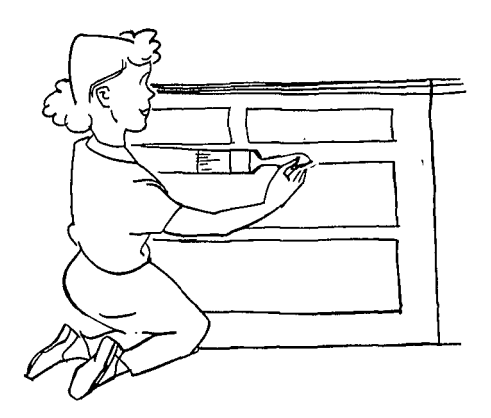
Hold the brush horizontal.