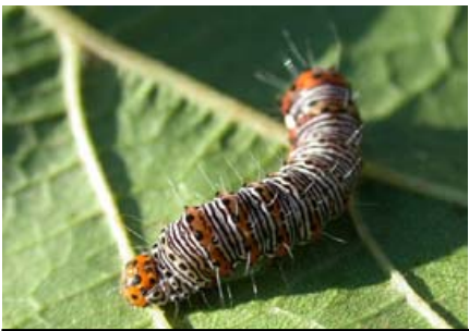
Eightspotted forester larva

Adults emerge and oviposit on grape shoots and leaves in May and June. The caterpillars feed on foliage, leaving petioles and larger veins. The larvae are blue-white with bright orange stripes, black lines and black spots. It also has an orange head with black spots, and is 1 1/2 inches long at maturity. When larvae are full-grown they drop to the ground to pupate in the soil and leaf litter. There are two generations per year.