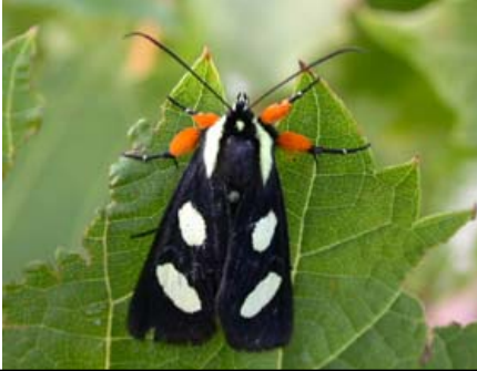
Eightspotted Forester adult