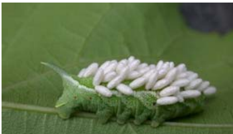
Tomato hornworm parasitized by Cotesia congregatus on a grape leaf

Hornworms feed only on solonaceous plants (e.g., potato, tomato), however, hornworms have been observed on grape foliage (see image, below). Eumorpha achemon larvae feed upon grape and Virginia creeper foliage.