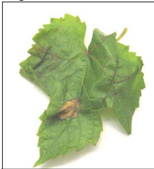
Upper leaf surface with Downy Mildew

Infected leaves will develop yellowish-green lesions on the upper surface 7 to 12 days after infection. As lesions develop, the affected area becomes brown, or necrotic, and is limited by veins. Fungal sporulation occurs on the lower leaf surface in the form of a delicate, dense, white growth. This downy growth is what gives the disease its name. Leaves that are severely infected may curl and abscise from the vine. This defoliation can decrease winter hardiness and reduce sugar levels in the developing fruit. This type of infection is also the main source of inoculum for berry infection and overwintering for the next season.