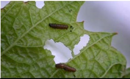
Grape flea beetle larvae

Both species have similar biology, life cycle, and feeding behavior, but differ slightly in their oviposition behavior. A. chalybea oviposits on buds and bark crevices, whereas A. woodsi oviposits on the underside of leaves later in the season.