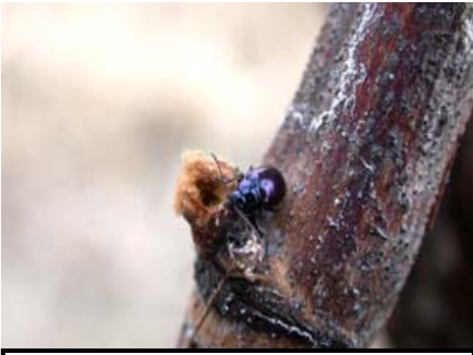
Grape flea beetle adult on a damaged bud