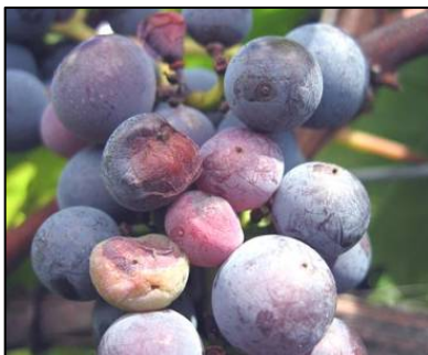
Early stages of black rot on berries

Berry infection is the most serious phase of black rot, possibly leading to significant economic losses. Berries are susceptible to infection immediately prior to bloom through four weeks after bloom. The first sign, easily missed, is the appearance of a small, whitish dot that is quickly surrounded by a reddish, brown ring. This ring can grow from 0.1mm to 2mm in one day. Within a few days the berry will start to dry out, losing their spherical shape and becoming flat on one side. These berries will appear light or chocolate brown and quickly turn dark brown and