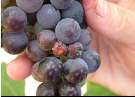
Grape berry moth injury

The larvae cause economic injury in three ways: 1) contamination of fruit, 2) reduction in yield, and 3) entry points for diseases.