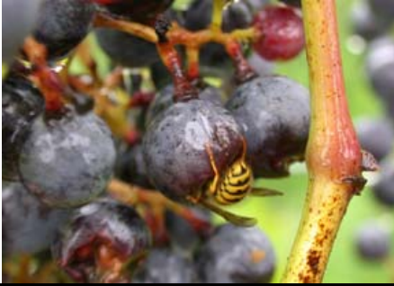
Yellowjacket feeding on an injured grape

Yellowjackets feed on ripe grapes in late summer and early fall, damaging the crop. They also may be a danger and annoyance to pickers.