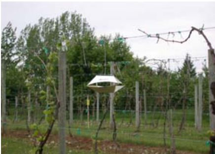
Sticky trap in vineyard

Most vineyards have either consistently high or low damage from GBM each year. Because of this, researchers at Cornell have come up with a relatively simple risk assessment that growers can use to assess the potential threat of GBM damage in their vineyard. Three major factors that predict GBM damage severity in a vineyard are 1) whether vineyards are bordered by wooded areas or hedgerows, 2) winter temperature and snow cover in the vineyard and 3) GBM infestation history in the vineyard. See the 1991 publication, Risk Assessment of Grape Berry Moth and Guidelines for Management of the Eastern Grape Leafhopper , for more information http://nysipm.cornell.edu/publications/grapeman/files/risk.pdf