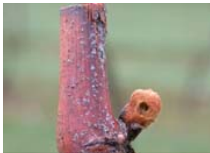
Grape flea beetle damage to grape bud

Damage is caused by adult beetles feeding on primary buds, which prevents them from developing into shoots, thus resulting in a decreased yield. The greatest economic loss occurs when beetles feed on buds from “bud swell” until the “first leaf separates from the shoot tip” stages (see Appendix A). Once shoot growth reaches 7 cm, damage caused by the grape flea beetle normally does not affect yield. Location of vines can affect the intensity of an infestation, with vines on the borders of the vineyard and next to wooded areas having higher infestations. In addition, weather can also affect the intensity of the damage. Cooler springs will extend the period of development when buds are more susceptible to the beetle feeding, thus increasing the chance of economic loss.