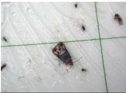
Grape berry moth adult on a sticky trap (E.C. Burkness & T.L. Galvan, U of MN)

The adult grape berry moth is an inconspicuous, mottled brown-colored moth with a bluish-gray band on the inner halves of the front wings. It is approximately 1.2 cm long, with a wingspan of 0.8 to 1.3 cm. The newly hatched larva is creamy white with a dark brown head and thoracic shield. Later instars are green to purple in color, and are 0.8 cm in length when fully grown.