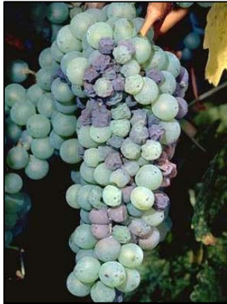
Botrytis on a grape cluster

Under specific climatic conditions B. cinerea is known as the noble rot. This type of infection is highly sought after in many regions of Europe, creating some of the world's best sweet white wines. In order for this pathogen to become the noble rot, the temperature needs to be between 68-77°F (20-25°C) and the relative humidity between 85-95% during the infection phase. Following infection, the relative humidity needs to decrease to 60%, which is the key factor in dehydration of the berries (Dharmadhikari 2007).