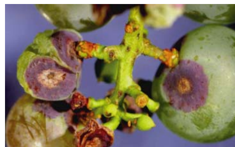
Anthracnose on grape berries

Berry clusters are susceptible to anthracnose before flowering through veraison. Small, reddish circular spots develop first on the berry. They average 1/4" in diameter and may become sunken and have a narrow, dark brown to black margin. The center of the lesion begins as a violet color but becomes velvety and whitish gray over time. This coloration gives the pathogen its common name "bird's eye rot". Berry