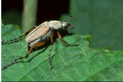
Rose Chafer