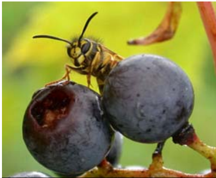
Yellowjacket on a grape cluster

The yellowjacket is about 1.3 cm long and has alternating yellow and black bands on the abdomen. Foraging yellow jackets are often mistaken for honeybees because of their similar appearance and the fact that they are sometimes attracted to the same food source. Honeybees are slightly larger than yellow jackets and are covered with setae (hair) which are mostly absent on yellow jackets. Foraging honey bees can be identified by the pollen baskets on the rear legs that are often loaded with a ball of yellow or green pollen. The yellow jacket has a smooth stinger that can be used to sting multiple times, whereas the honey bee has a barbed stinger that can be used to sting only once.