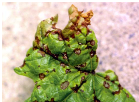
Anthracnose on grape leaf

Young, infected shoots develop small isolated sunken lesions with round or angular edges and a violet to brown margin. The center of the lesion may extend to the pith of the shoot and a callus will form around the edge. These lesions can cause shoots to crack and become brittle. Anthracnose lesions on shoots can be confused with hail damage; the difference is that anthracnose has raised black edges. Anthracnose infection on the petioles exhibits symptoms similar to the shoots.