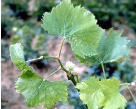
Fanleaf Degeneration