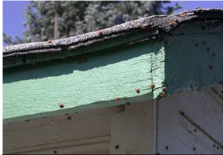
MALB adults on a building (U of MN)

Adult MALB migrate from fields and wooded areas to buildings in the fall. Ohio researchers have found that the fall migratory flights generally begin on the first day temperatures exceed 64°F following the first cold spell with temperatures dropping to near freezing. MALB seek out cracks or holes where they will spend the winter in clusters of few to many individuals. There are two generations of MALB each year.