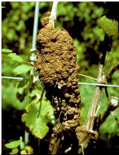
Crown gall on grape vine

Symptoms begin near the base of the trunk as small, smooth cankers. Galls can also occasionally be observed on fruiting canes and even on roots. Infected grape vines have weak vigor with chlorotic leaves and usually smaller clusters. These plants are more prone to injury by low temperatures.