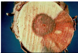
Eutypa dieback in vine

The most obvious signs for grower to look for in the field appear in the spring when healthy shoots are 12-24 inches long. Shoots growing on infected canes will appear deformed and discolored. Young leaves will appear smaller, cupped and chlorotic (yellow). They may develop small necrotic spots and tattered margins. These leaf and shoot symptoms are not as obvious later in the growing season due to healthy vigorous growth obscuring diseased growth. The leaf symptoms will become more pronounced each year until the infected portion of the vine dies.