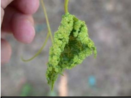
Severe gall formation on a grape leaf

Foliar phylloxera can reduce the photosynthetic activity of grape leaves. In addition, the leaf galls cause distortion, necrosis, and premature defoliation. Premature defoliation may delay ripening, reduce crop quality, and predispose vines to winter injury. Populations must reach very high densities before yield is affected, and this is rare. The impact of infestations over years on the overall health and vigor of the vine is unknown.