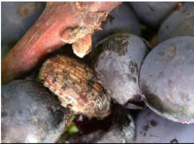
Bumble flower beetle within a grape cluster

Adults are often observed at the sites of plant wounds and also on fermenting fruit. Larvae develop in decaying organic matter. Adult bumble flower beetles are approximately 1.3 cm in length, and have yellowish-brown or cinnamon-colored elytra with irregular longitudinal rows of small black spots. The head and thorax are densely hairy, as is the underside of the body, the latter being covered with numerous white hairs.