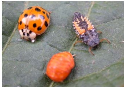
MALB adult, larva, and pupa (U of MN)