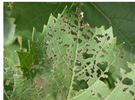
Feeding damage from Japanese beetle

This pest can be a problem particularly in new vineyards using grow tubes. The adults are skeletonizers, in that they eat the leaf tissue between the leaf veins but leave the veins behind, giving the leaf a lace-like appearance. Leaves fed upon by Japanese beetles soon wither and die.