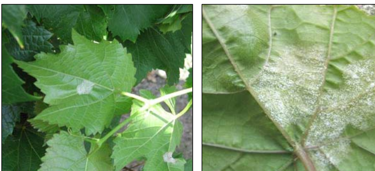
Lower leaf surface with downy mildew, left, and close up view, right

Young shoots, tendrils, petioles and inflorescences are also infected by downy mildew. Infected shoot tips will generally thicken, curl and become white with spores. They will, eventually, turn brown and die. Other new growth will exhibit similar symptoms and if they are attacked early enough will die off.