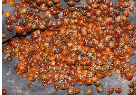
MALB adult aggregation (U of MN)