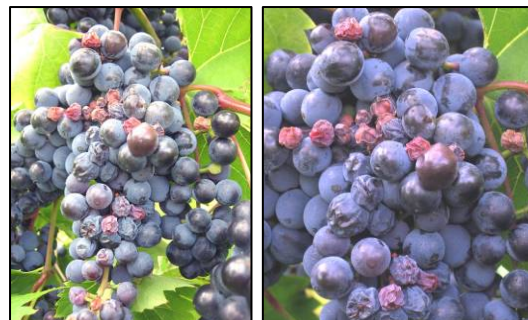
Late stages of black rot on berries

Guignardia bidwellii , the causal organism of black rot, overwinters in mummy berries on the vineyard