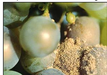
Botrytis on white grapes

Berry infection is the most common type of infection and can seriously reduce the quality and quantity of the crop (Ellis 2004). After veraison, grapes are infected through the epidermis or wounds. Botrytis will progressively invade the entire cluster. It will develop faster in tight clusters where