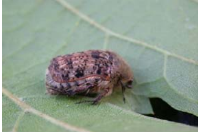
Bumble flower beetle