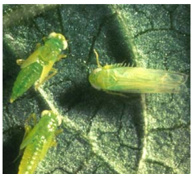
PLH nymphs (on left) and adult (on right)

PLH adults are lime green, slender, small (0.3 cm long), and somewhat wedge-shaped with heads that are slightly broader than the rest of their bodies. They usually have 6 small white dots directly behind their head that can be seen with magnification. The nymphs are similar to the adults except that they are smaller, wingless, and paler green (see image, left). Grape leafhoppers are orange-yellow in color, and have dark spots and yellow lines on the forewings. Both the adults and nymphs are very active. The adults jump or fly away as you walk through the vineyard or brush your hand over plants. If you disturb the nymphs, they move very quickly in a distinctive sideways movement across the leaf in an effort to hide on the underside of the leaf. Grape leafhoppers,