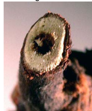
Apple twig borer tunnel in a grape vine (E.C. Burkness, U of MN)

Feeding by the grape cane borer can reduce node survival and fruitfulness, the number of clusters per cane, and cluster