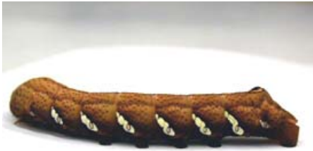
Achemon sphinx moth larva, the “hornless hornworm”