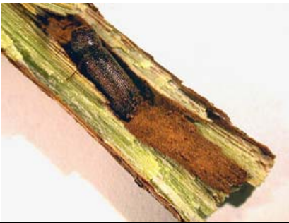
Apple twig borer adult in a grape vine

The apple twig borer overwinters as an adult within burrows made in live canes. As weather warms, they become active in late April and early May. Adults emerge in early spring and deposit eggs from April to June in the bark of grape vines. Young larvae burrow into the vine, usually to the pith, and tunnel along the stem, packing their frass behind them. Larvae mature and pupate in fall and early winter. Many pupae transform to adults in fall. Adults usually hibernate with head downward in larval galleries through winter.