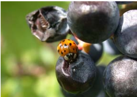
MALB adult on a grape berry

MALB can be a devastating contaminant in wine production. MALB is difficult to remove from clusters of grapes during harvest. Subsequently, some of the MALB may be crushed with the grapes during processing. The flavor of the resulting wine can be tainted by the alkaloids contained in MALB. Adults tend to aggregate on clusters with injured berries just before harvest, and eventually they may be incorporated with the grapes during wine processing (Koch et al. 2004, Pickering et al. 2004). Once disturbed or crushed, MALB releases a yellow fluid, via reflex bleeding, that contains alkaloids and alkylmethoxy pyrazines that are thought to be used