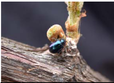
Grape flea beetle adult

Grape flea beetles are small insects, approximately 0.3 – 0.5 cm long, shiny, with enlarged hind legs used for jumping. In the field, they can be identified by their size and coloration. A. chalybea is dark blue or blue-purple, larger than A. woodsi , and the body is 0.3-0.5 cm long, whereas A. woodsi is blue-green in color and somewhat smaller (0.4 cm).