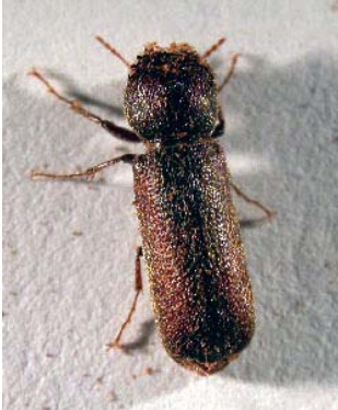
Apple twig borer adult

Adults are elongate, approximately 0.5-1 cm long with a reddish brown to brownish black color. Larvae are white with brown head and about 1 cm long when mature.