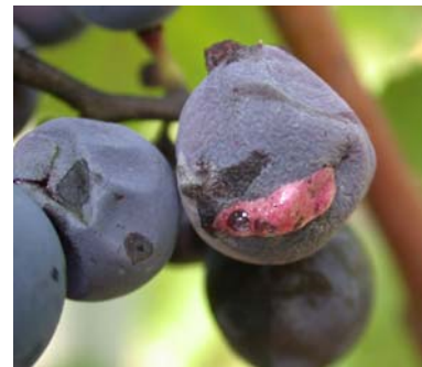
Grape berry with splitting (T.L. Galvan, U of MN)

At the end of the summer, MALB starts to prepare for winter by accumulating fat and sugar reserves. MALB adults move to vineyards, orchards, and other autumn ripening crops to feed on injured fruit (Koch and Galvan 2008). In the vineyard, grape clusters that have been injured due to physiological splitting, yellowjackets or birds are an attractive option for MALB. The proportion