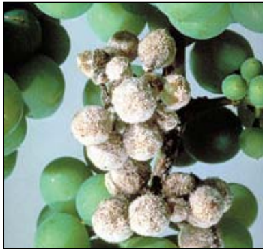
Berries infected with downy mildew

Young berries are highly susceptible to downy mildew infection. When infected, they appear grayish in color and are covered in a downy felt. Young fruit becomes resistant to infection three to four weeks after bloom. Infected white varieties will turn a dull gray-green while red varieties will turn pinkish red. The infected berries will remain firm in the cluster and are easily distinguished from healthy ripening berries.