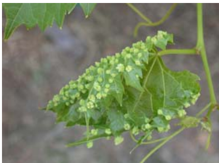
Galls on a grape leaf caused by grape phylloxera