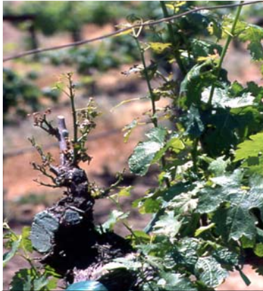
Eutypa dieback in vine