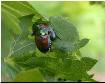
Japanese beetle adults

Adult beetles can be identified by their brilliant metallic green, with copper-brown forewings that do not entirely cover the abdomen, five lateral brushes of white hairs on each side of the abdomen, and two brushes of white hair on the last abdominal segment. Eggs are approximately 0.10 cm in diameter and are laid in grassy areas near vineyards. Larvae are typical white grubs, c-shaped, and are limited to feeding only on the roots of grass and weeds.