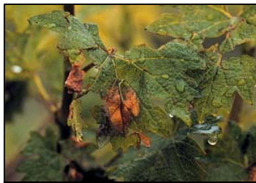
Symptoms of Botrytis on leaves

The first symptoms of Botrytis may be observed in early spring on buds and young shoots. Infected shoots and buds may turn brown and dry out. Before bloom leaves may exhibit large, irregular, reddish brown, necrotic patches that are usually localized on the edge of the lamina (Pearson 1998). A gray mold may or may not be observed on the leaf. Botrytis can invade the inflorescences before bloom, which causes the bloom dry out and fall off the vine (Pearson 1998). This stage of infection can lead to high yield losses. The pathogen then moves to the end of stamens of aborted berries still attached to the clusters. From these infections Botrytis moves to the pedicel or rachis creating