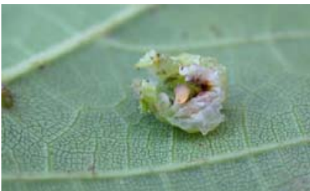
Grape phylloxera nymph inside of a gall

Adult grape phylloxera are tiny aphid-like insects with a yellow body. The foliar form of grape phylloxera causes the formation of tiny galls to form on the leaf. The galls extend below the leaf surface and fully enclose the insect. The gall opens to the upper leaf surface which allows the nymphs to exit.