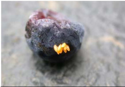
MALB eggs on a grape

MALB adults are approximately 0.5-0.8 cm long and round. The coloration of MALB adults ranges from orange to red with zero to 19 black spots, to black with red spots. The most distinguishing feature of adult MALB is the black “M”-shaped marking on the center of the pronotum (shield-shaped area behind the head). Eggs are yellow and oval-shaped. MALB larvae are alligator-shaped with black and orange markings, and are spiny in appearance.