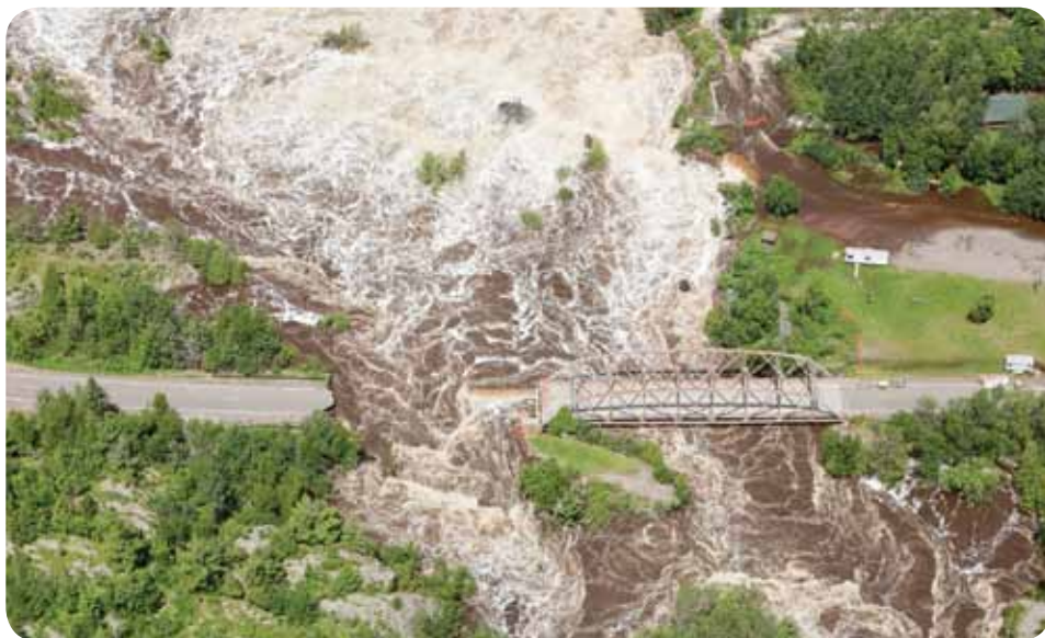
Severe flooding in June 2012 knocked out key infrastructure in northern Minnesota.

The 258-page book is published by Routledge and is available from major booksellers. Fisher, a regular contributor to the online news site the Huffington Post , discusses key points from the book in a December 5, 2012, blog post titled “Are Hurricanes Our Next Dust Bowl?”