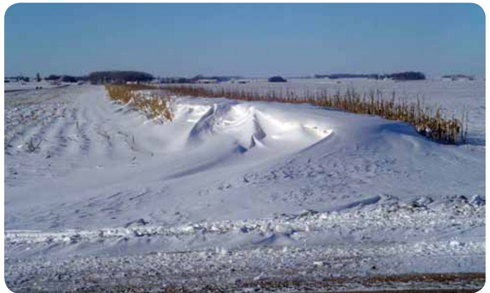
The new payment calculator can be used to help set reimbursement rates to landowners.

Using the new web-based version of the snow fence payment calculator, highway officials can easily plug in values such as labor and material