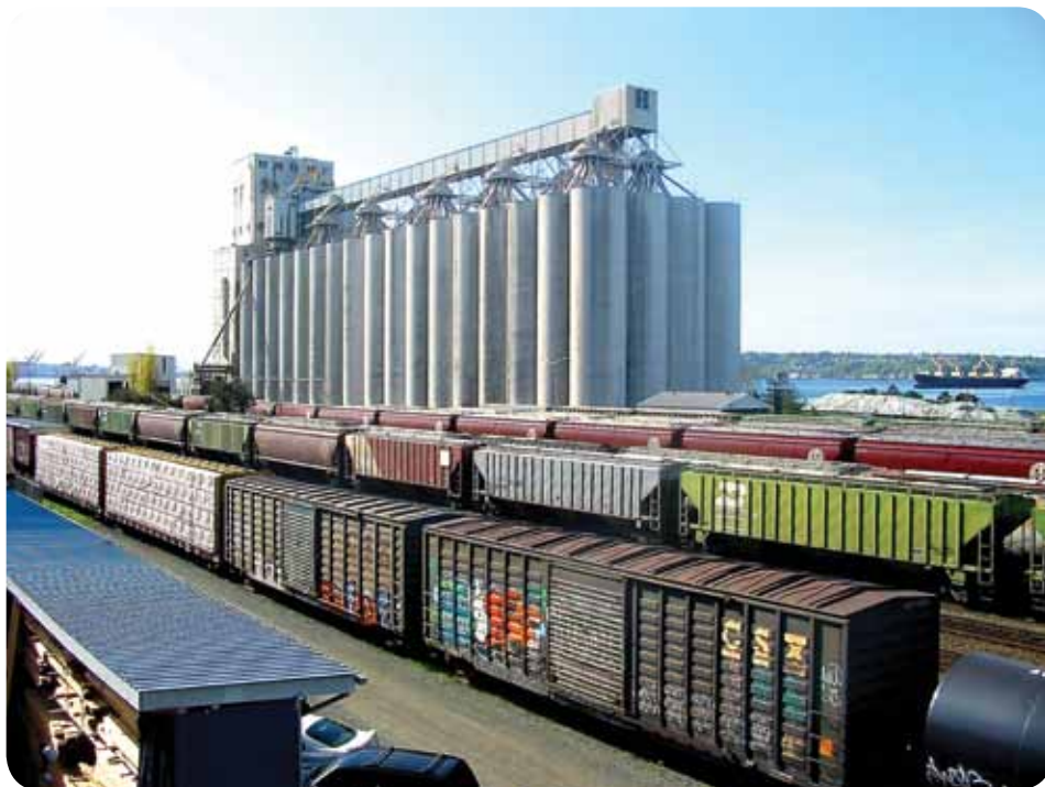
Agriculture, mining, and manufacturing are key industries in Minnesota that depend on rail.

Moving forward, what does the freight industry need? "It needs to be